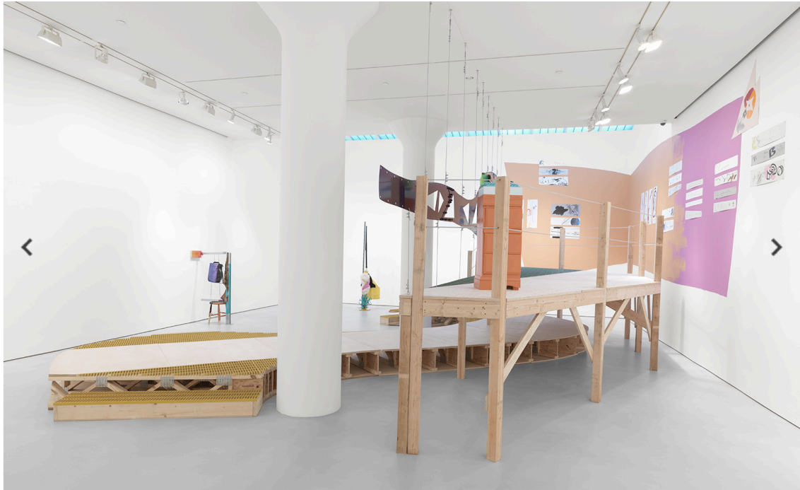
Blurring the boundaries between painting, sculpture and architecture, Stockholder's works emphasise explorations of process, form, and, above all, gravity. Pictured: The Guests All Crowded Into the Dining Room , installation view, 2016