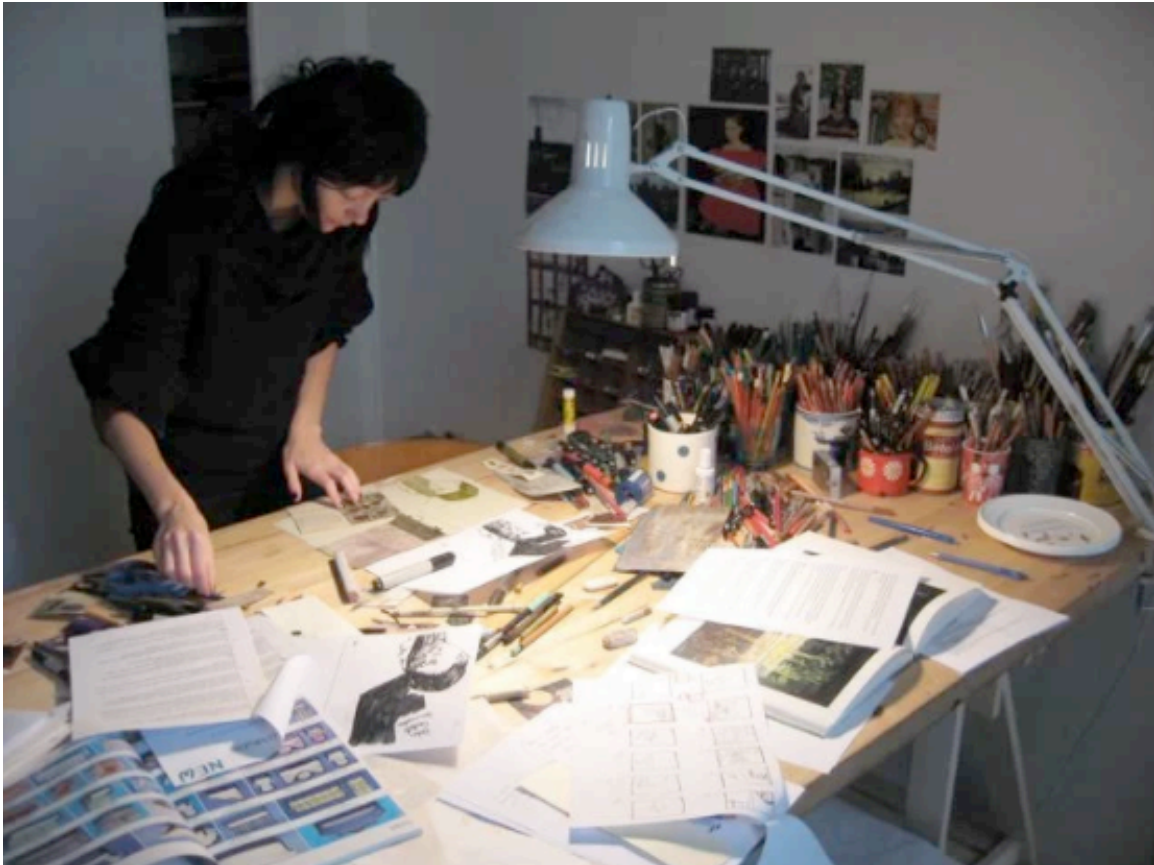
Illustrator making use of flexible office hours.