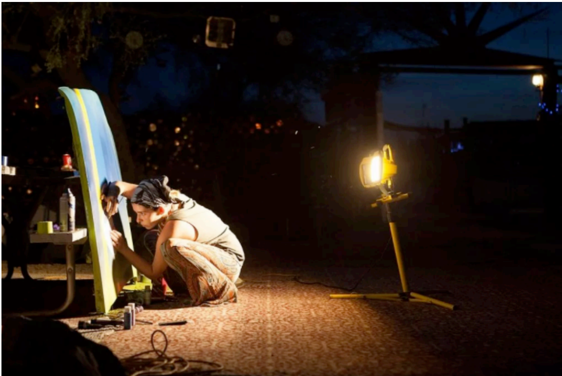
An artist working on a mural.

What makes some artists more successful than others? Talent, luck, and hard work certainly play a part, but there are other, subtler habits that many of the greats seem to have in common. We asked 11 artists about their work routines and the way they structure their lives to see how these everyday rituals, big and small, make them tick. Below, see the 12 habits that help these artists create their best work.