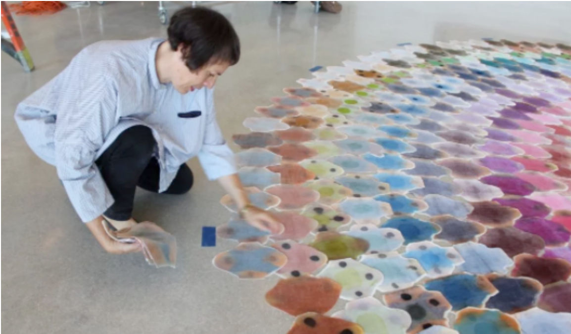
Polly Apfelbaum assembling Mojo Jojo at the Pérez Art Museum Miami, 2013.

Art-making is often a solitary activity, requiring enough self-discipline to structure one's own time. "I work eight hours a day consistently—and if I don't manage it during the day, I make up for it in the evening," says Liza Lou. "It's a lot like being an athlete: you train under all conditions. Just get in the studio no matter what you feel like."