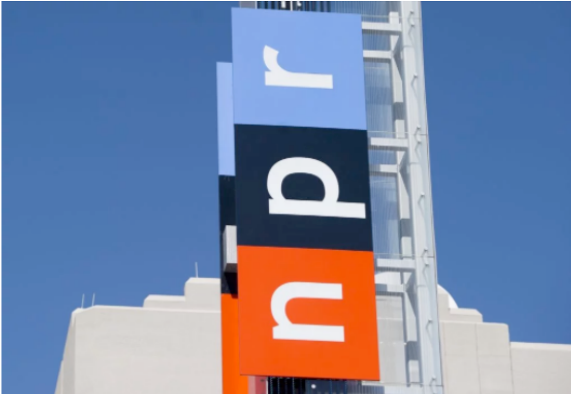
National Public Radio headquarters.