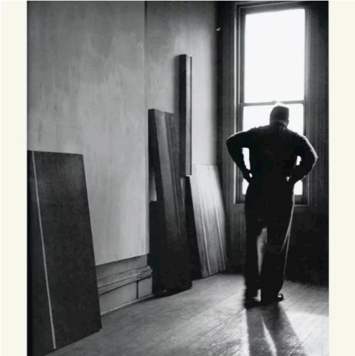
Barnett Newman, 1951.