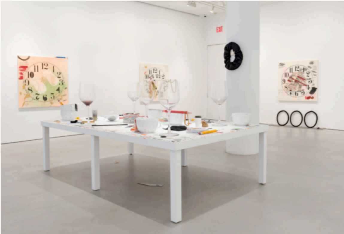
Installation view of "MY PEN IS HUGE" at Mitchell-Innes & Nash, NY, 2017