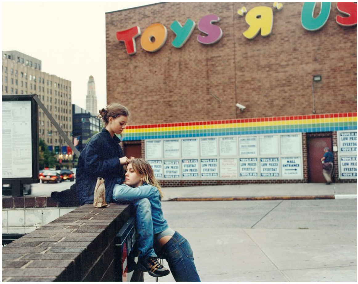
"Toys R Us," 1998.