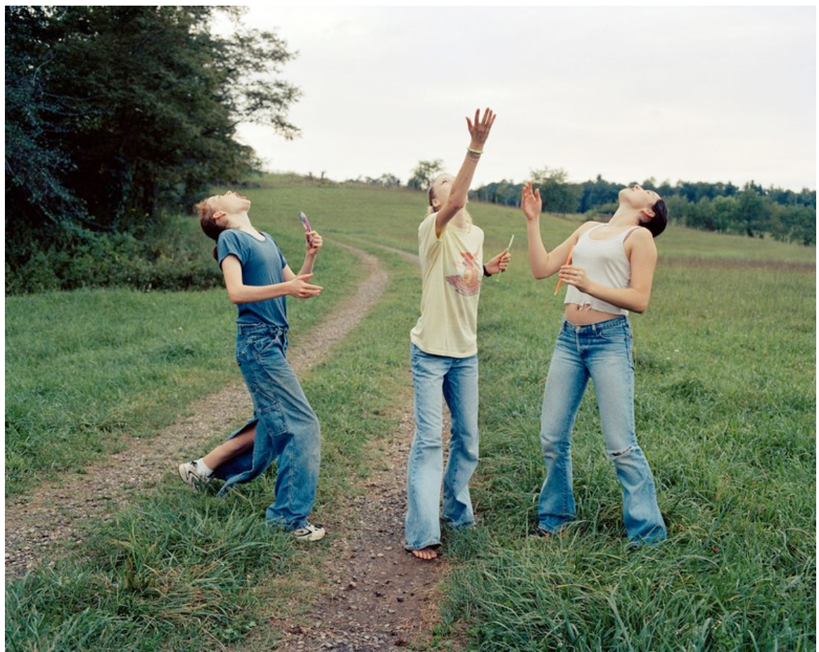
"Candy Toss," 2000.

recognition after taking part in the 1999 group show "<u>Another Girl, Another Planet</u>," which anticipated our own era's photography of the female gaze.