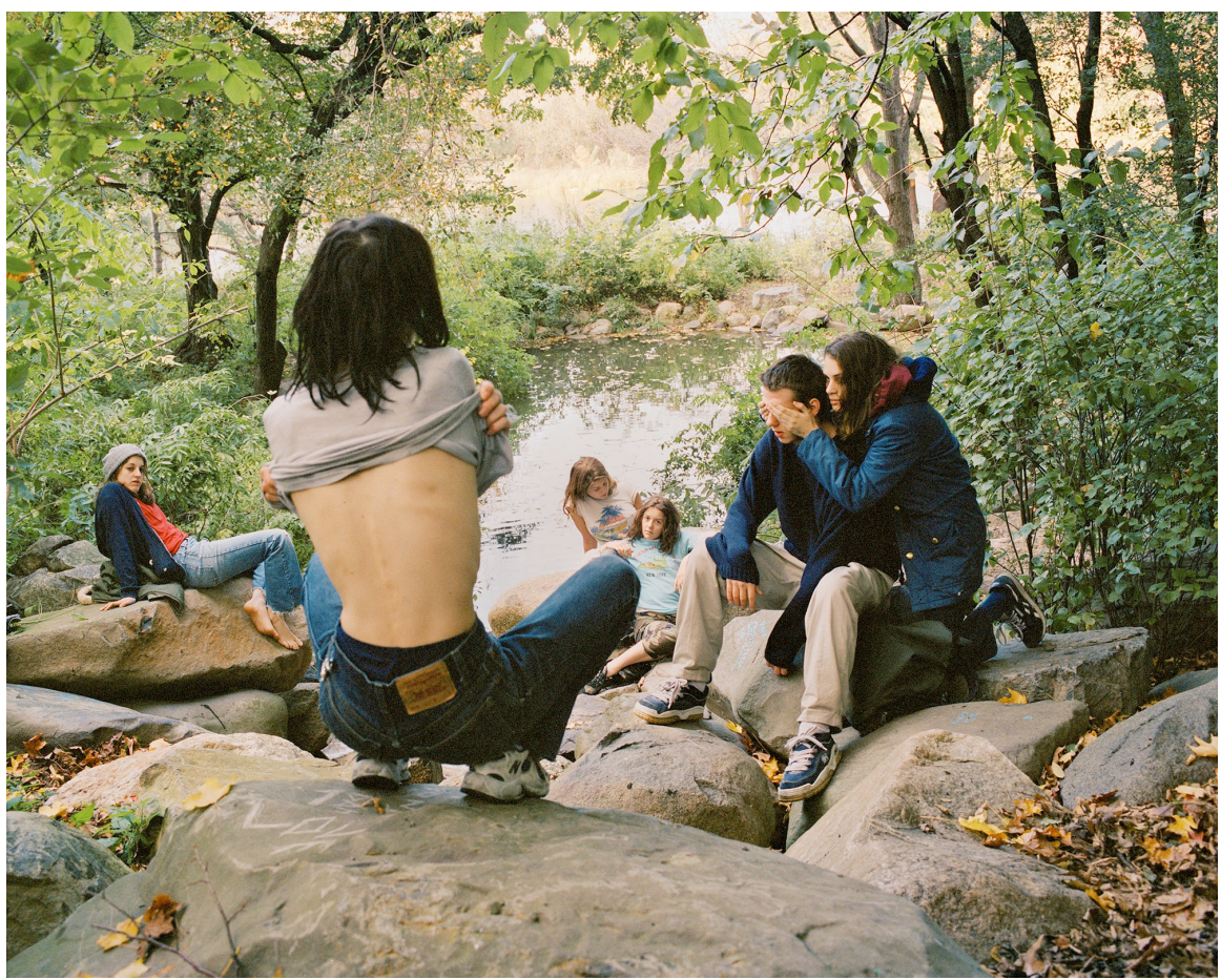
"Boy Torture: Love," 1999.

choreograph wherever she stopped, and the girls, she writes, "went home after we made photographs, while I kept driving."