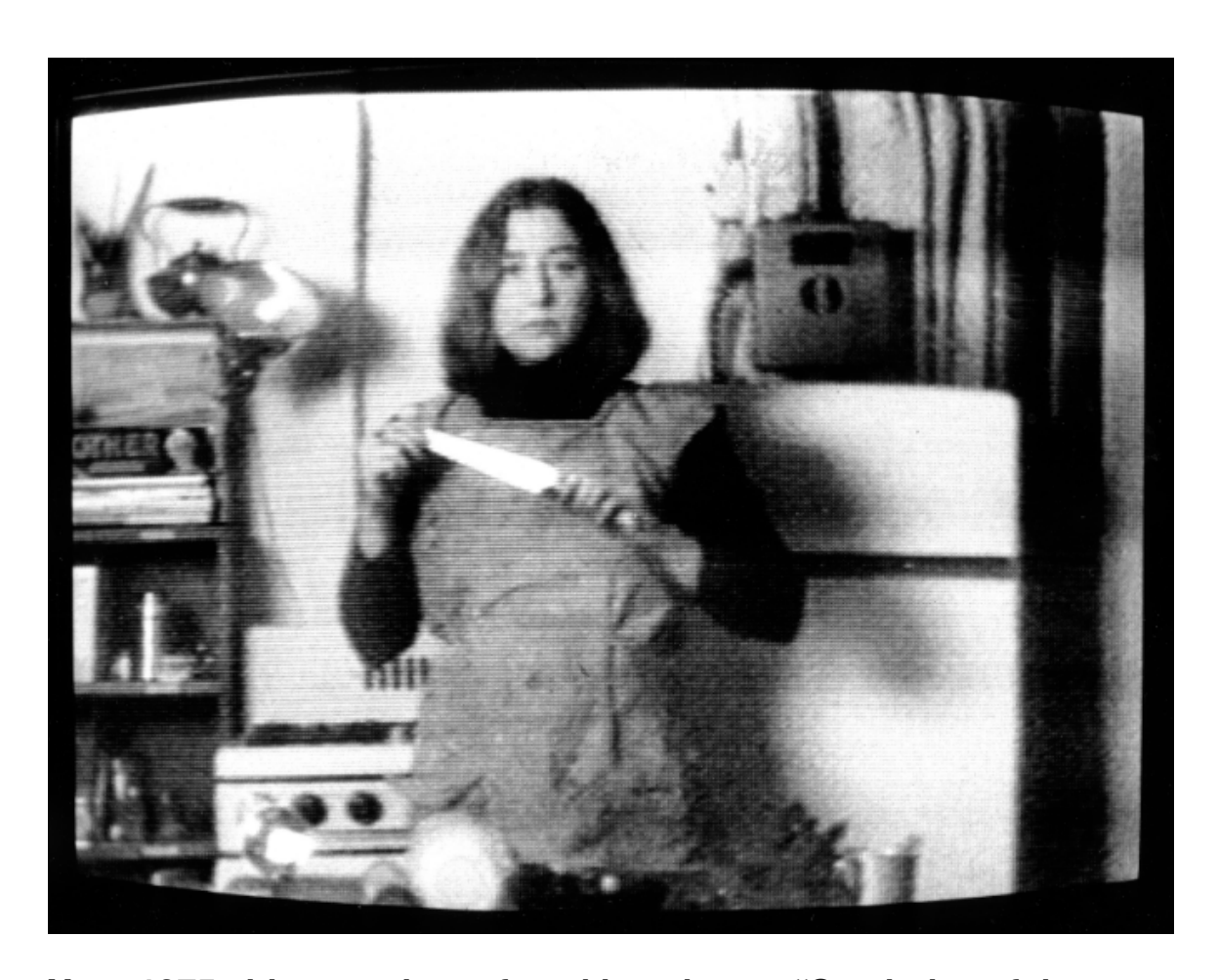
Your 1975 video send-up of cooking shows, "Semiotics of the Kitchen," is probably your most famous piece. Did Julia Child inspire it?

Yes, but not just her. I was also thinking about those late-night TV ads for Veg-O-Matics. All those things depicted the kitchen as being the natural habitat of women, so I was pushing back on that.