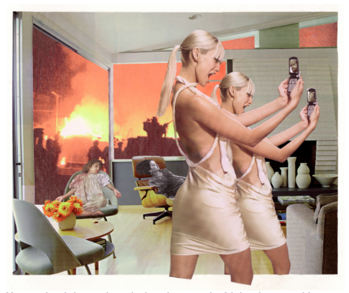
You revived the project during the wars in Afghanistan and Iraq, as if you were picking up where you left off.

Yeah. In 2004, I was invited to be in a show called "Election," and it hit me that I should do exactly the same thing because, by that time, those old antiwar works were becoming aestheticized and depoliticized. People in the art world kept asking, "Are you stupid? You've already done this." My answer was: "The United States is also doing the exact same thing again by getting involved in a quagmire, so who's being stupid here?"