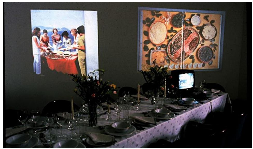
Martha Rosler, "A Gourmet Experience" (1974), installation with banquet table, video, slide projections, audio, books, cookbook readings, and prints of the food novel A Budding gourmet

In the multi-part installation a "A Gourmet Experience" (1974), a long, rectangular table is set for a banquet, complete with immaculate china and table settings. At first, it seems like a nice place to rest in a sprawling exhibit, but before visitors can relax, they're presented with videos and projections of people cooking, as well as voiceover from Rosler admonishing her guests: "A cook can't just slap things together. The best cooks are like magicians. Chefs are like orchestra conductors. Taste, mastery, and magic are things that need cultivation. Art is not an accident." Rosler's deadpan delivery in the audio pokes fun at the self-seriousness of food media. When did nourishment and joy become so theoretical, so in need of advanced study?