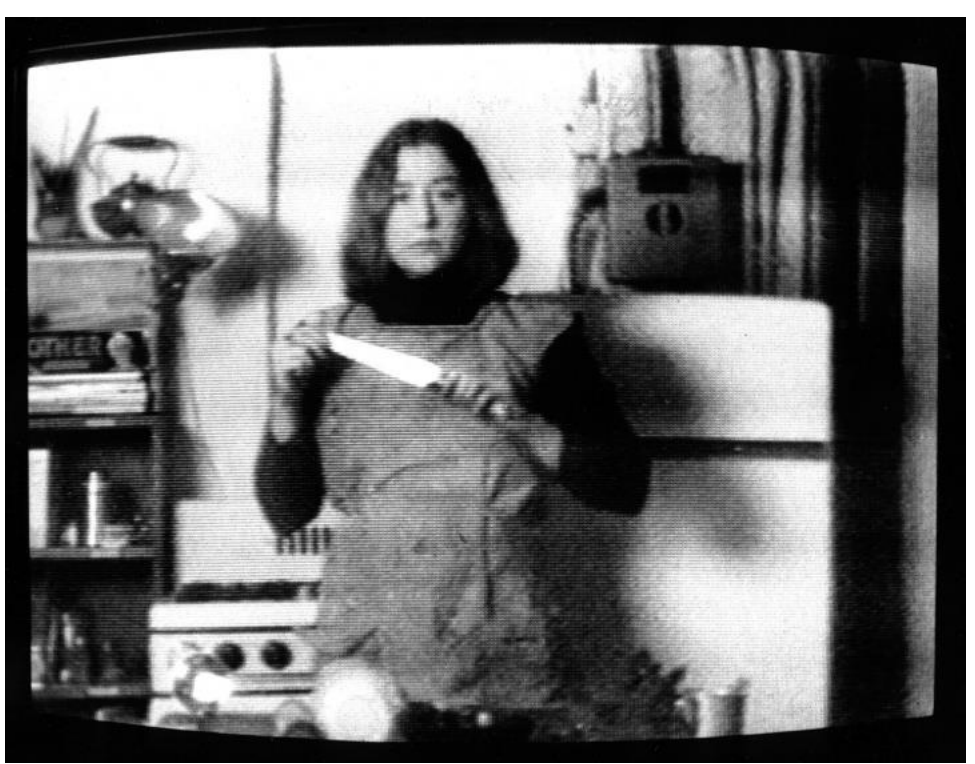
Martha Rosler, still from "Semiotics of the Kitchen" (1975), black-and-white video, 6 min., 30 sec.