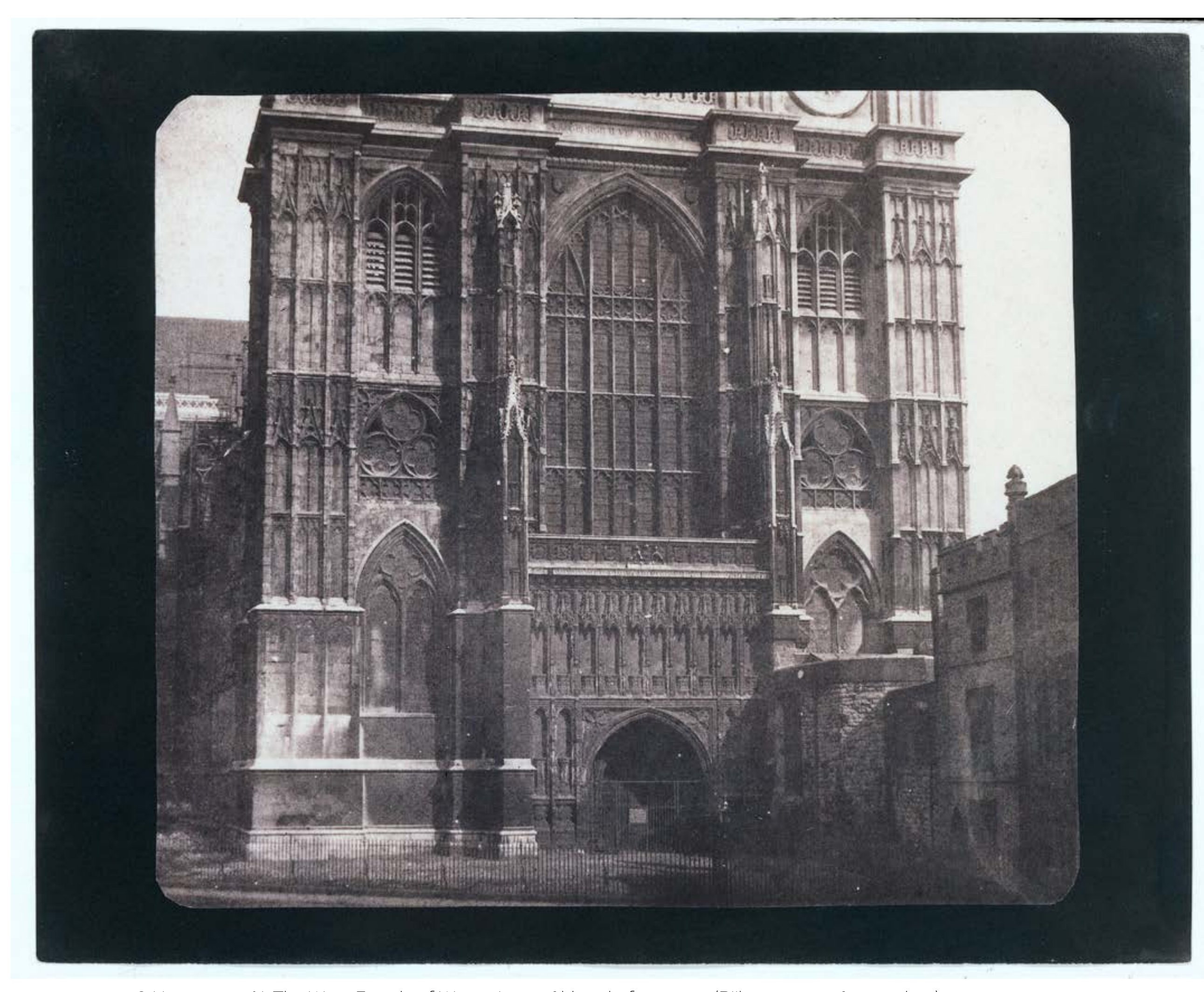
© Henneman, N. The West Façade of Westminster Abbey, before 1945 (Rijksmuseum, Amsterdam)

This research focuses on the participatory photography potential to set the environment for taking collective action; starting from dismantling the idea of single authorship and leading to the definition of photography as the democratic tool for excellence.