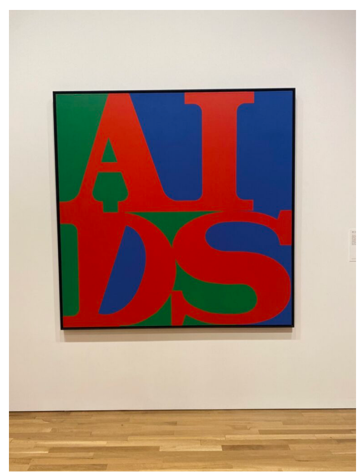
Part of the General Idea AIDS exhibit at the National Gallery of Canada.

The pharmaceutical industry has made it difficult to obtain medications worldwide due to high costs and distribution restrictions. I see them as a capitalist industry that thrives on people's misfortunes. That is what is conveyed through this painting. Wherever you looked during the HIV crisis, everything was infected. The one thing that was supposed to offer some solace and save people malfunctioned too. And so many had to perish before scientists and government agencies decided to act.