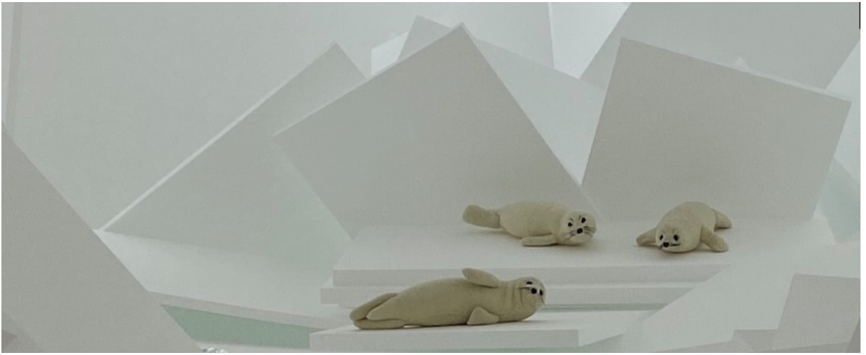
The Great Polystyrene Cold, part of the General Idea AIDS exhibit.

Throughout the pandemic years, Queer art has become a lifeline for the Queer community. In my opinion, one of the best examples of Canadian Queer art is the <u>General Idea AIDS exhibit</u> currently on display at the <u>National Gallery of Canada</u>. It takes the dark and deadly history of the HIV epidemic and turns it colourful. It's a breath of life that tells the story of the victims of the HIV plague.