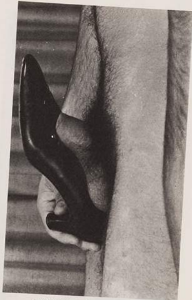
"Fetishism occurs almost entirely in men."