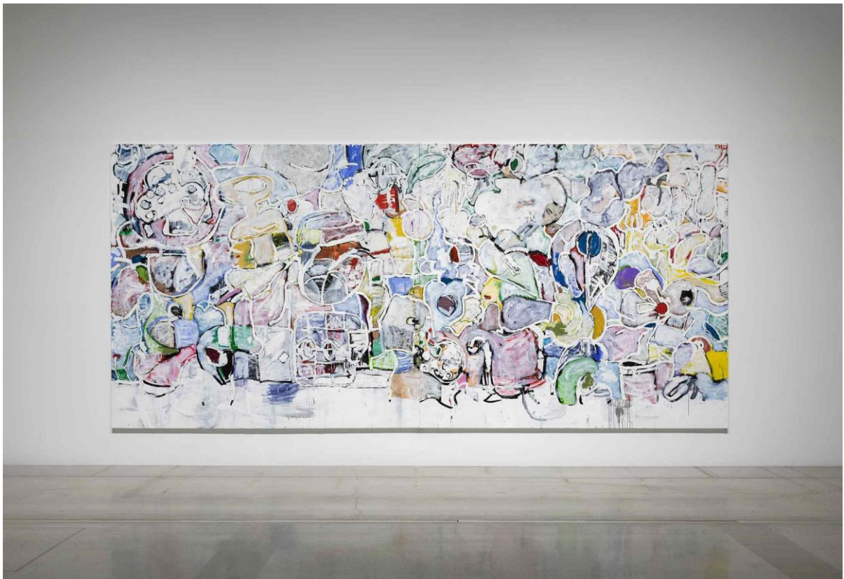
Eddie Martinez, To Be Continued , Installation View, Space K Seoul