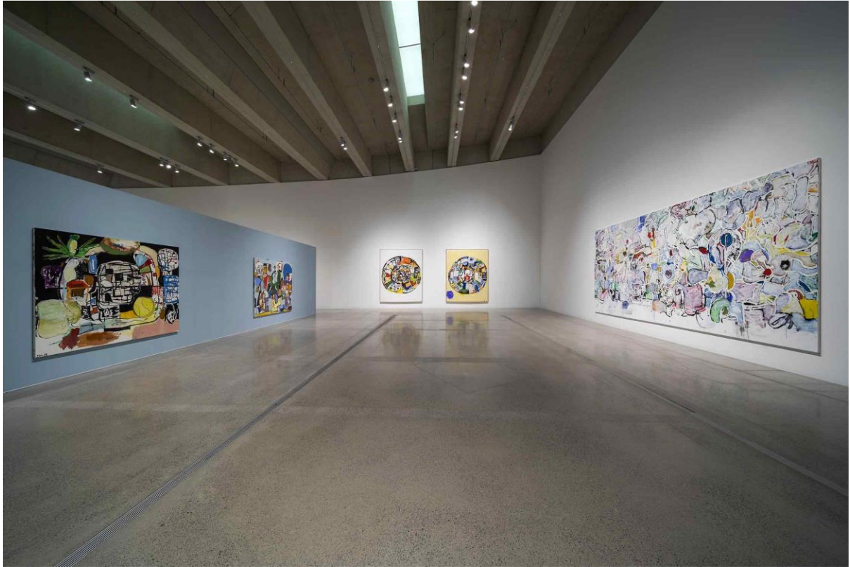
Eddie Martinez, To Be Continued , Installation View, Space K Seoul