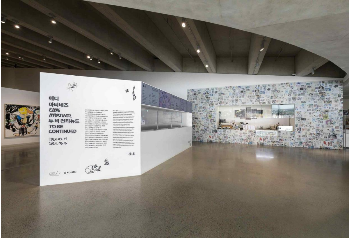
Eddie Martinez, To Be Continued , Installation View, Space K Seoul