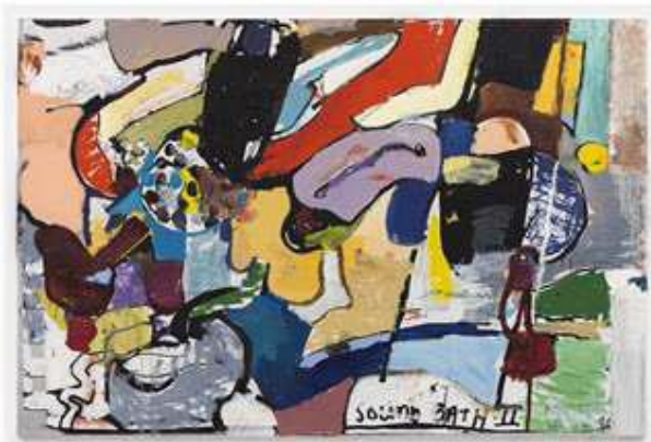
Emartllc No. 4 (Sound Bath II), 2023, Oil, acrylic and silkscreen ink on linen, 182.9 x 274.3 cm

o Eddie Martinez's works are characterized by swift lines and bold colors. The canvases feature a variety of motifs that have recurred over the years such as butterflies, flowerpots, tennis balls, and blockheads, all which were inspired by the artist's everyday life. His method of working, which he calls it a "study of making the same painting, but differently" is an attempt to strip away preconceived notions of the subject in order to understand the image differently. The artist also collages found objects from everyday life including trash, baby wipes, chewing gum, and scraps of canvas fabric from his work to create unique textures. The artist states that the driving force behind his recent work is his desire to return to his true nature. In today's digital age where we come across countless processed images and believe them to be real, the artist is interested in everyday objects and emphasizes the importance of visual experiences that happen around us.