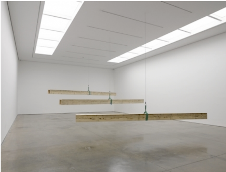
Virginia Overton, Untitled (2015)

The current exhibition at White Cube Mason's Yard will continue through March 14th.