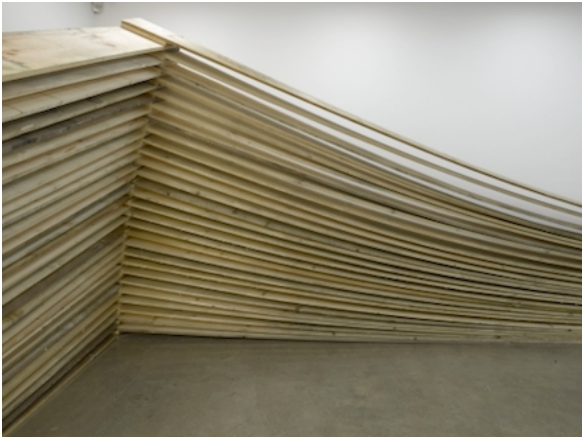
Virginia Overton, Untitled (2015)

On view in London at White Cube in Mason's Yard is an exhibition of new large-scale minimalist sculptures by American artist Virginia Overton. The exhibition is Overton's first in the UK.