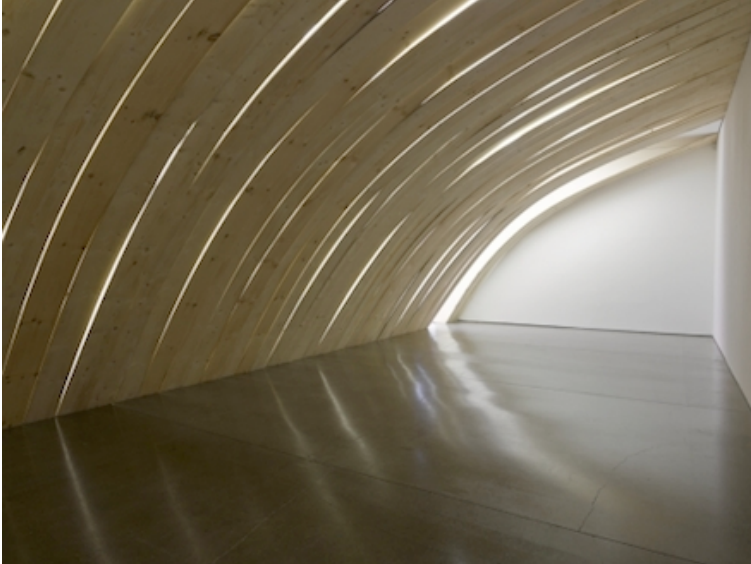
Virginia Overton, Untitled (2015)

An interesting dichotomy of use is bound up in Overton's works here, rendering pieces and their remainders with equal aesthetic value. Repositioning the final work as a relation to its initial materials, rather than a finalized, rigid form, Overton's particular brand of aesthetic sustainability makes for an intriguing visit to the space.