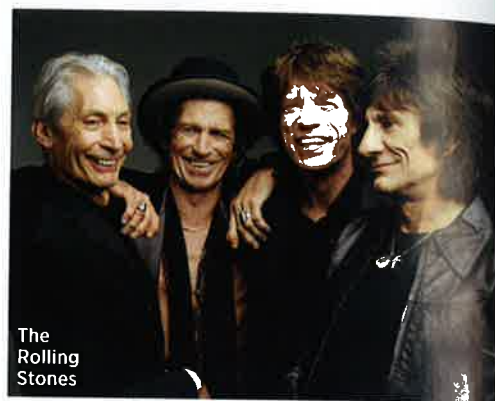
The Rolling Stones