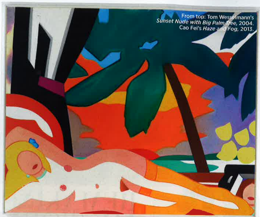
From top: Tom Wesselmann's Sunset Nude with Big Palm Tree , 2004. Cao Fei's Haze and Fog , 2013.

POP APPEAL Tom Wesselmann's prismatic Pop paintings are on view at New York's Mitchell-Innes & Nash gallery, on April 21. Meanwhile, MoMA PS1 hosts Beijing artist Cao Fei's first solo museum show in the U.S., displaying her multimedia, fantasy-fueled depictions of life in China, beginning April 3.