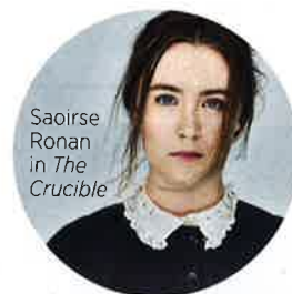
Saoirse Ronan in The Crucible

"Exhibitionism," at London's Saatchi Gallery (April 5) marks the first major retrospective of the Rolling Stones' 54-year history, featuring costumes, personal artifacts, and never-before-seen video footage.