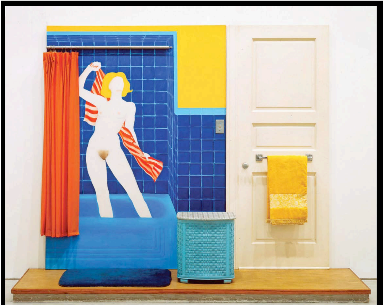
"Bathtub Collage #3," 1963.

"Bathtub Collage #3," 1963, mixed media, collage and assemblage on board, Museum Ludwig, ©The Estate of Tom Wesselmann/licensed by VAGA, New York, NY