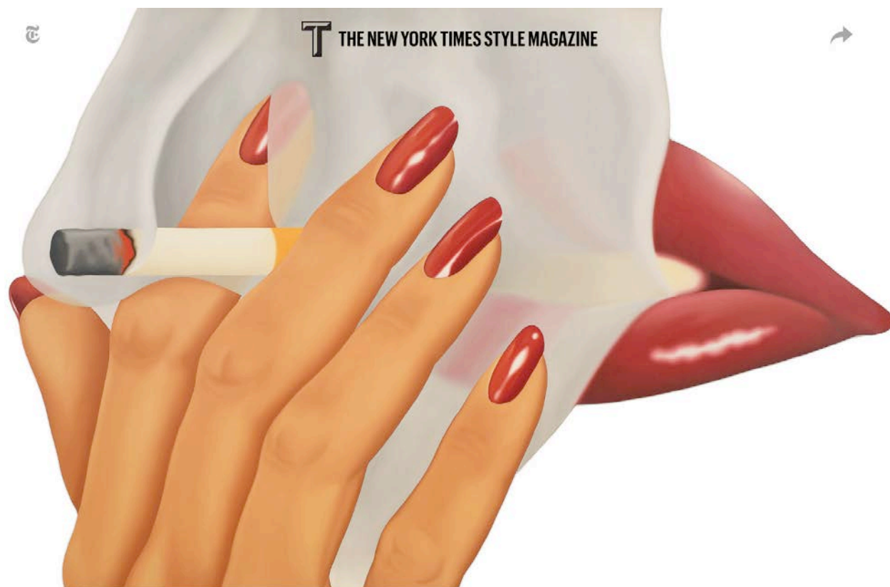
"Smoker #8," 1973, oil on shaped canvas. © The Estate of Tom Wesselmann/licensed by VAGA, New York, NY