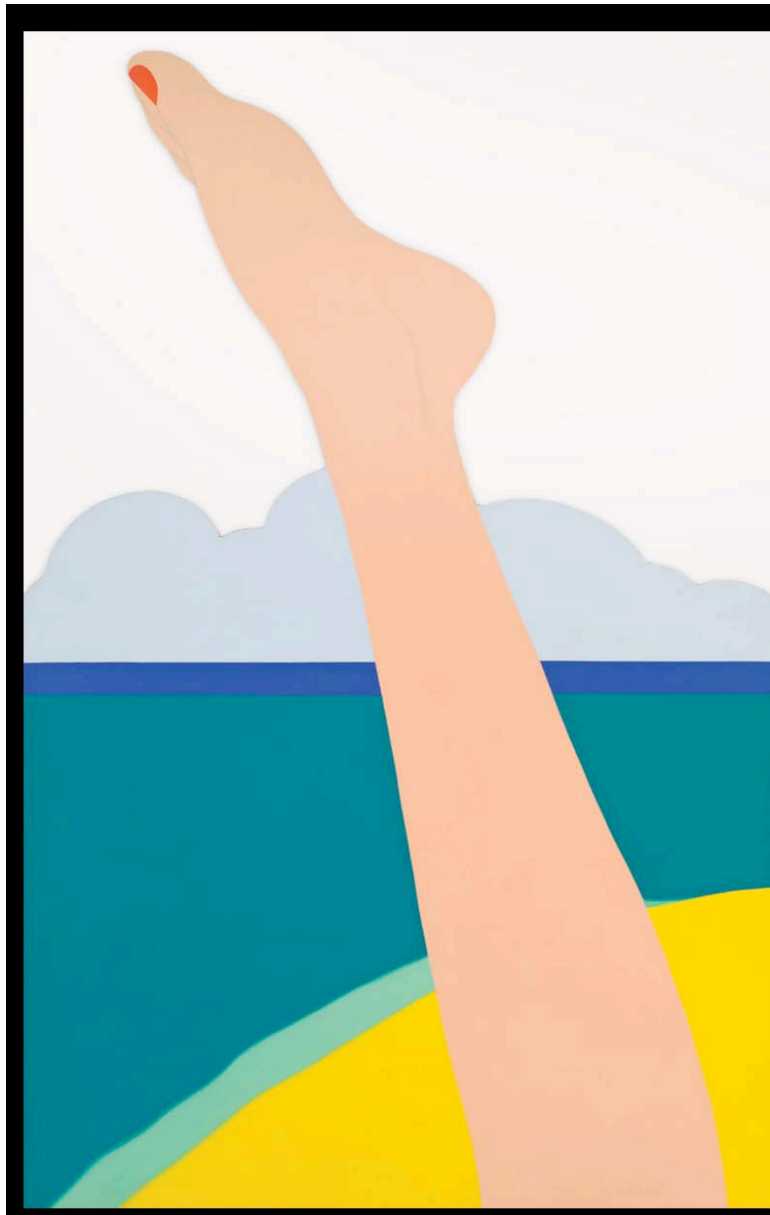
"Seascape #22," 1967.

"Seascape #22," 1967, oil on shaped canvas, ©The Estate of Tom Wesselmann/licensed by VAGA, New York, NY