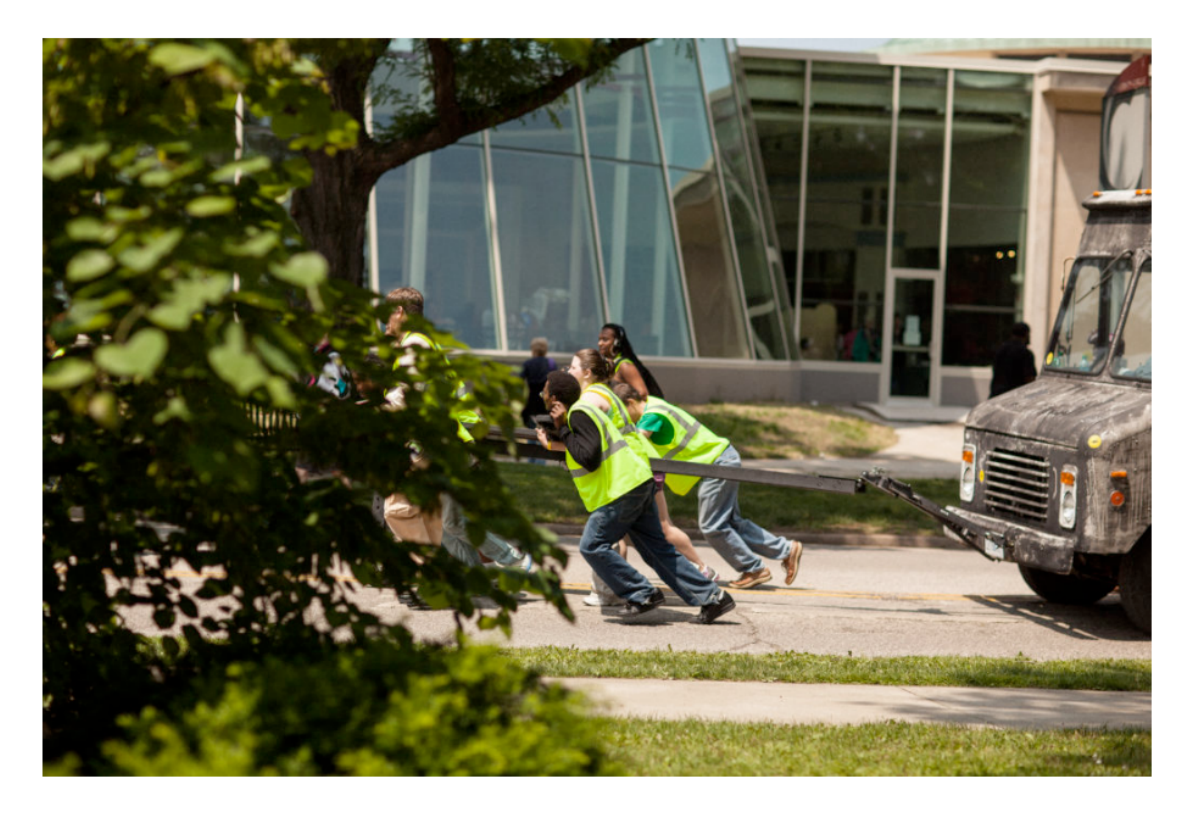
Pope.L. Pull! (2013).

composed of materials found in indigenous constructions (vines, logs, and straw), the other with typical industrial construction materials (bricks, cement, steel, glass, pipes), methods that "embody ways of life and two different projects of society that, even if they are possibilities for construction, already declare their forms of ruin," according to biennial literature.