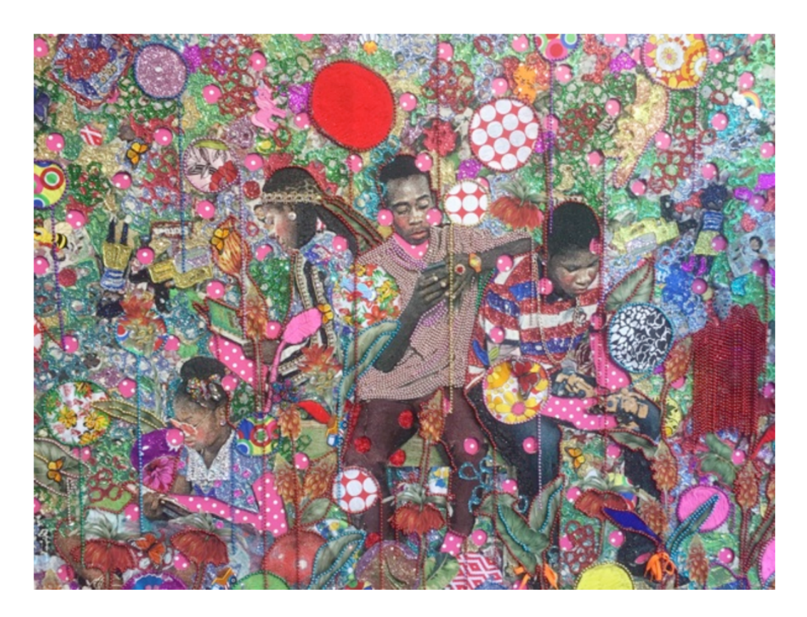
Ebony G. Patterson, ...they were discovering things and finding ways to understand... (...when they grow up...) (2016). Courtesy of the artist and Monique Meloche Gallery, Chicago.

For instance, Patterson's massive installation on the second floor of the pavilion features a series of works exploring the high murder rates of black children and teens in countries including Jamaica (where she was born), Brazil, and the US.