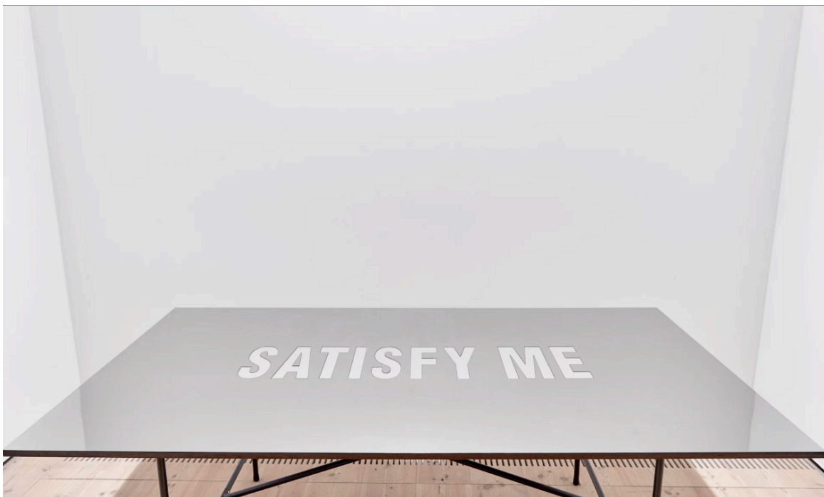
Monica Bonvicini, Satisfy Me Flat, 2009.

A Murano glass strap-on gleams under fluorescent light, in a play area with the gear all waiting: chains and black leather, a dangling noose and a body harness slung from the ceiling. I have been in S&M clubs like