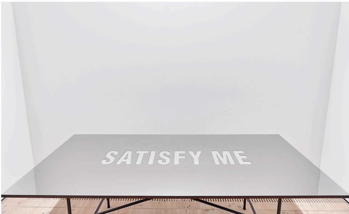
'Satisfy Me Flat', 2009.