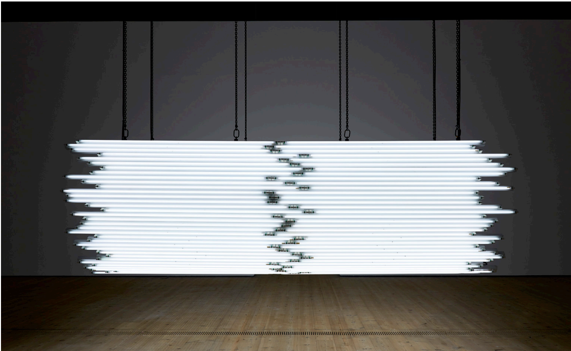
'Light Me Black', 2009.

Upstairs, in the exhibition's concluding half, gone are the maze-like webs of walls, the dark carpets, erotic objects and kinky tableaus. Enclosed, claustrophobic intimacy is replaced by a vast, open space. Viewers are instead confronted by a wall of a different kind – an impenetrable wall of light. Light Me Black (2009) is the most visually arresting piece on display. Hung from the ceiling, comprising industrial strip lights and originally created for the Art Institute of Chicago, 'the light tubes are the same fittings used in the museum's backstage areas and offices', Sillars informs. 'Monica often uses native bits of its architecture in the artworks.'