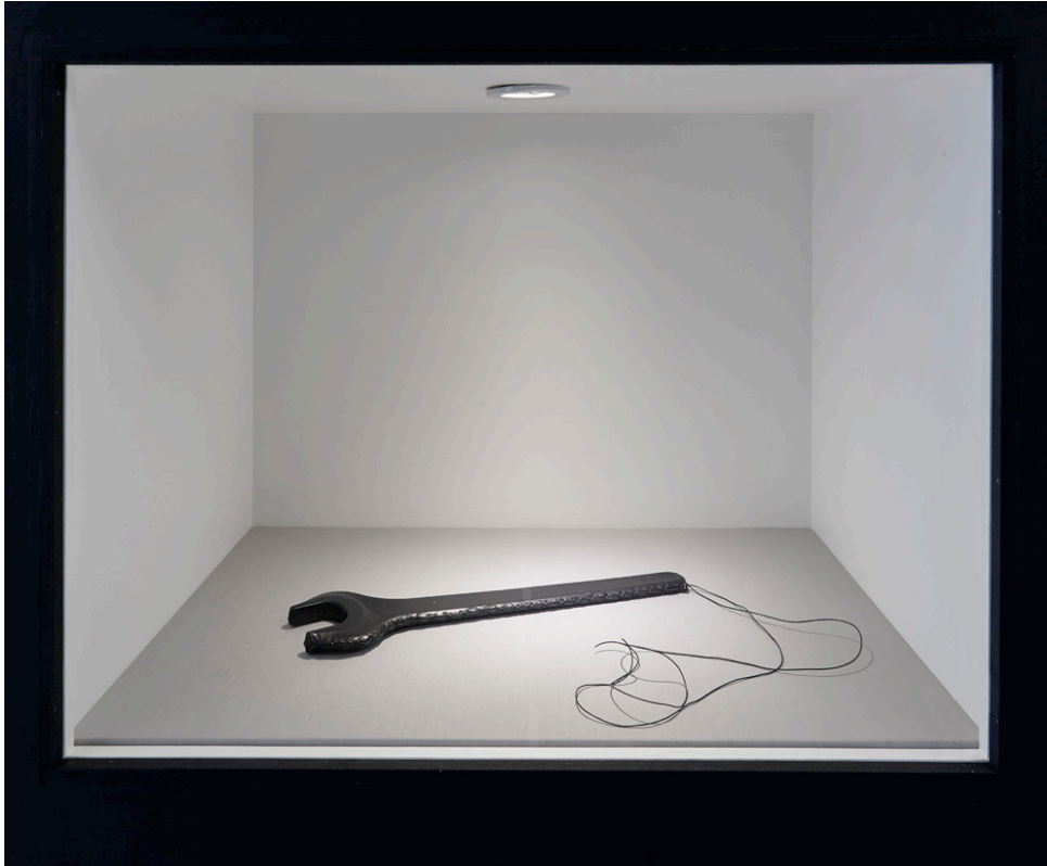
'Leather Tool (wrench)', 2009

With these thoughts well and truly embedded in visitor's minds, the 'teased out' eroticism is allowed to run wild throughout the rest of the display. Leather-clad axes, tools and belts are framed by glass cases, inside constructed rooms. Visitors are voyeurs; peeping-toms through windows and door frames. At the end of one corridor, the words 'SATISFY ME' are printed across a minimalist black table, in a seductive headline. Elsewhere, squares of black shag-pile carpets delineate different domestic settings – bedroom, hallway and living room, where a perspex dildo stands tall, celebratory, on a white pedestal.