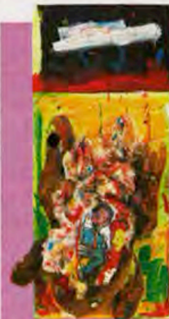
Crawling to Richard Pryor's House

I say if that were true, then volunteering at homeless shelters wouldn't matter, but anybody who works in one would tell you that it does. So