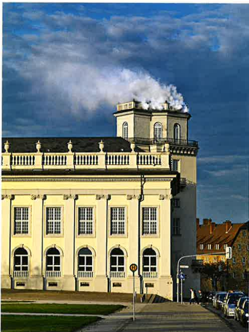
Installation view of Daniel Knorr’s Expiration Movement , 2017.