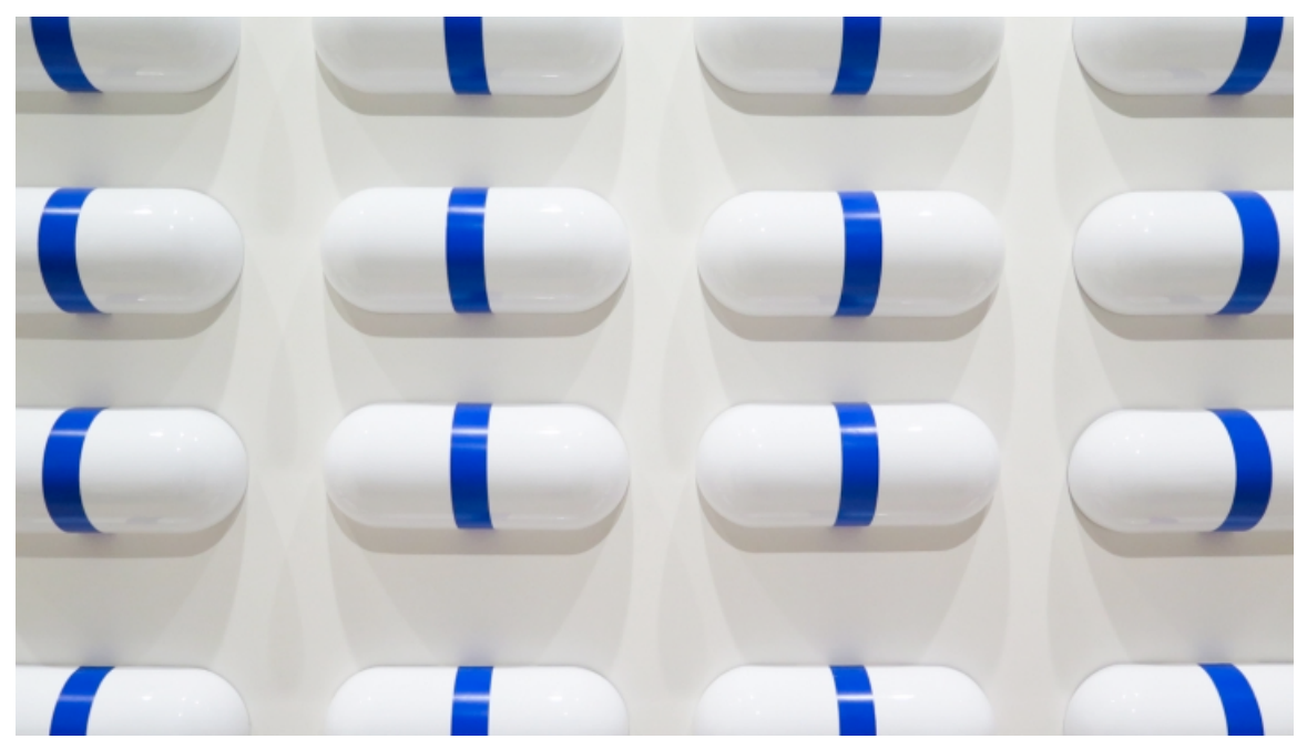
Installation view of General Idea's Broken Time at the Jumex Museum

This retrospective, titled Broken Time , is framed by a repeating bas relief motif of giant pills — a visualization of the countless drugs those infected with HIV ingested in hopes of lessening the deadly effects of the illness — and the collective's most iconic image, a repeated pattern of the "AIDS" acronym modeled after Robert Indiana's famous "LOVE" prints and sculptures. The evolution that the work takes, chronologically laid out across two floors of the museum, is drastic, beginning with text, video, and performance work derivative of the Fluxus and Dada groups, and ending with tweaked commercial objects pleading the urgency of the AIDS crisis, including a General Idea brand "Jockey Short Shopping Bag" and a series of caricature self-portraits by the three artists.