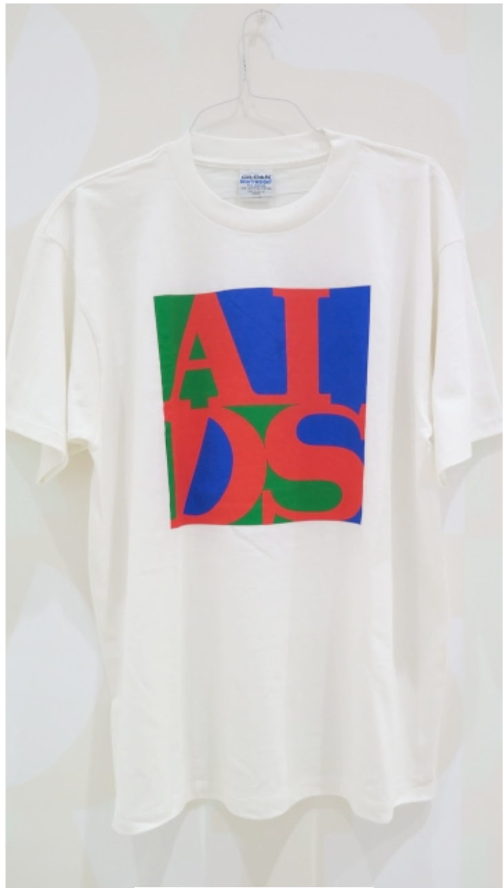
General Idea, "AIDS" T-shirt

It's a rare pleasure to see an artist or group of artists make their strongest work near the end (Cy Twombly's 2014 retrospective, Paradise , provided an astonishing example). For General Idea — which consisted of AA Bronson (born 1946), Felix Partz (1945–94), and Jorge Zontal (1944–94) — the impending misery of death brought about action rather than despair. The group approached the most serious possible subject matter