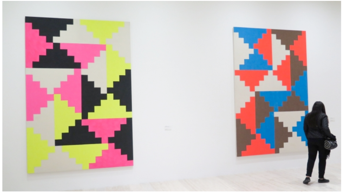
General Idea, "Mimi" (1968-–69)