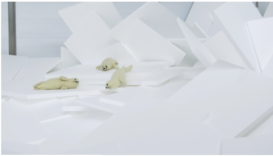
General Idea, "Fin de siècle" (1990)