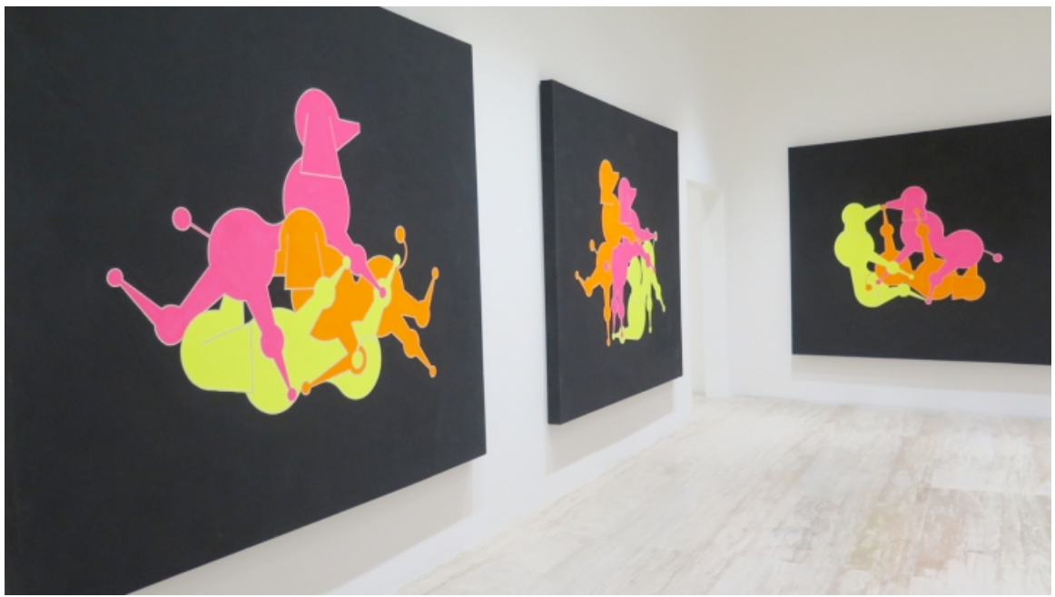
General Idea, "Modo Cane Kama Sutra" (1984), set of 10 paintings

It's encouraging that the Jumex team has gained back some specificity and moved — at least a little bit — away from over hanging its galleries and cluttering the exhibition spaces. The exhibition is still packed to the gills, but for the most part not gratuitously so. That said, one large gallery of Broken Time is completely taken up by an irritating installation that seems intended to protest climate change. Titled "Fin de sciècle" (1990), it consists of a group of toy stuffed seals sitting on a sea of Styrofoam in place of ice — in other words, a crazy waste of space. It would have been a more effective use of space if the giant foam monstrosity was left out and the rest of the work was given some room to breath. As such, it makes for a truly bewildering, off-topic departure from a catalogue of poignant and ephemeral projects activated by tangible action.