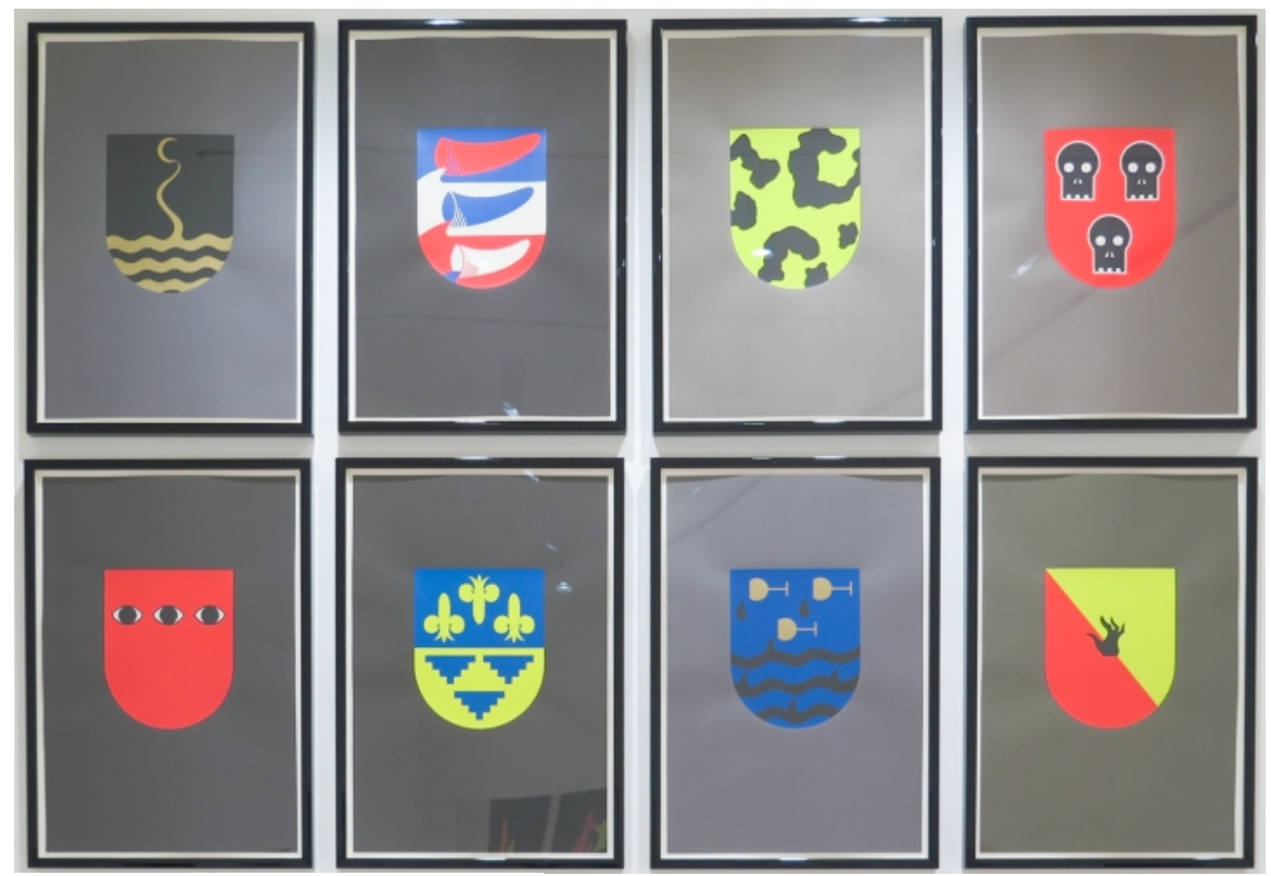
General Idea, "Fear Management" (1987)