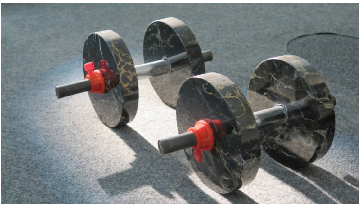
General Idea, "Reconstructing Futures" (1977), detail

Unsurprisingly, some of General Idea's more absurd and improvisational musings on the nature of performance and art practice were met with eviscerating criticisms or outright incomprehension. "I think it's a practical joke and a waste of money, and somebody is putting us on," a representative of the <u>St. Lawrence Centre for the</u> <u>Arts</u> told General Idea in a phone conversation that the artists documented during a presentation of their 1970 performance "What Happened" at the Festival of Underground Theater in Toronto. The multi-part performance, which was based on Gertrude Stein's <u>play of</u> <u>the same name</u>, was spread across the three week festival and included the "Miss General Idea Pageant."