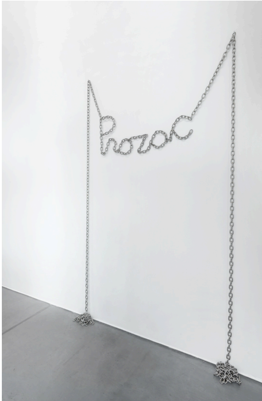
Monica Bonvicini, "Prozac," 2009. Nickel-plated steel chain, variable dimensions.