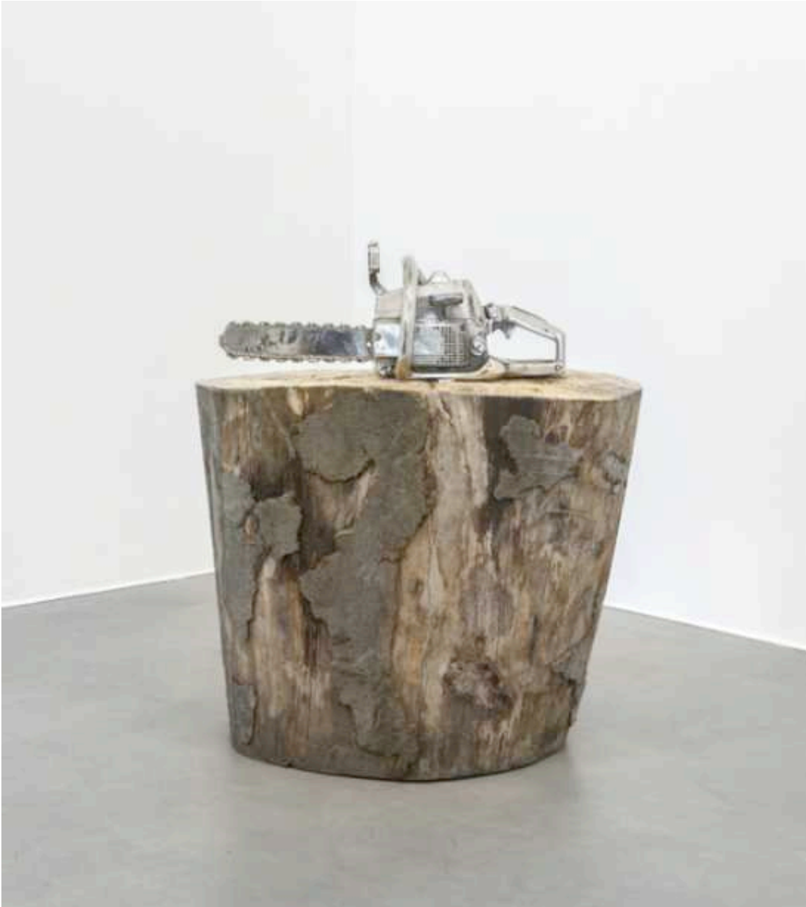
Monica Bonvicini, "Chainsaw chromed," 2012. Nickel plated chainsaw, 71.5 x 27.5 x 25 cm. Unique.