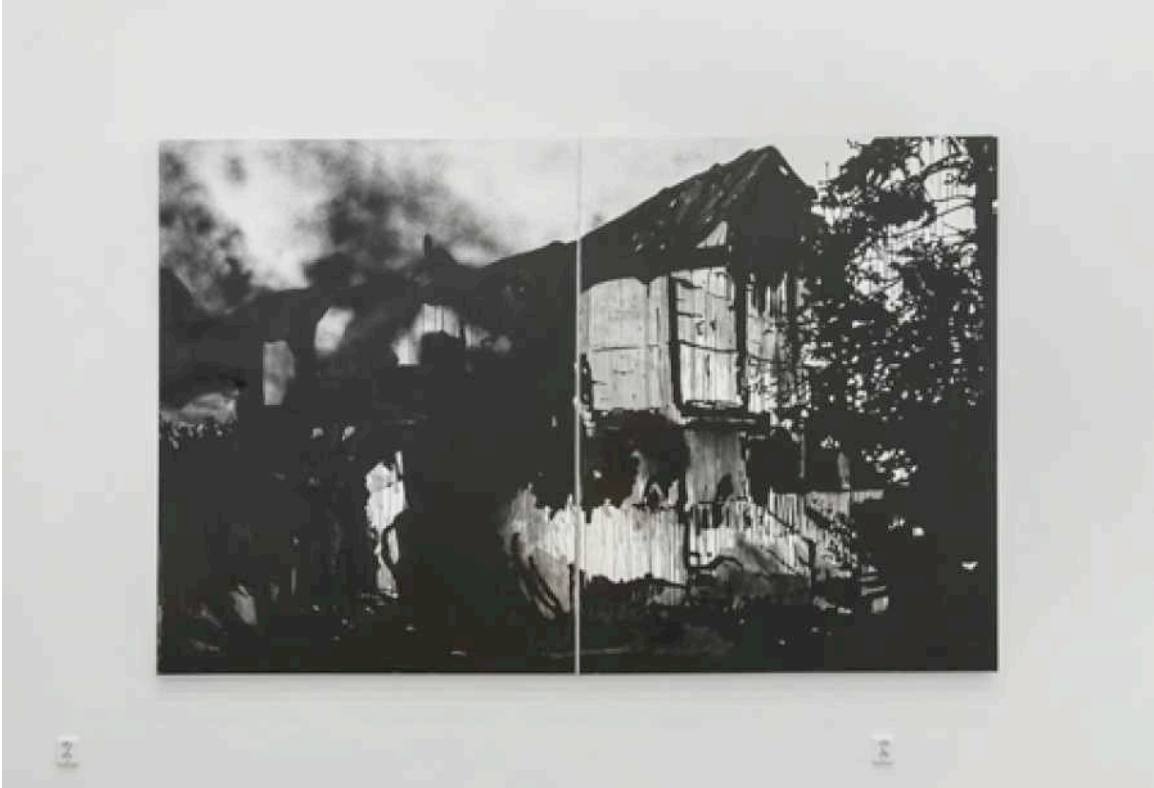
Monica Bonvicini, "Wildfire Kern," 2016. Tempera and spray paint on Fabriano paper, lined on fabric, 200 x 300 cm.