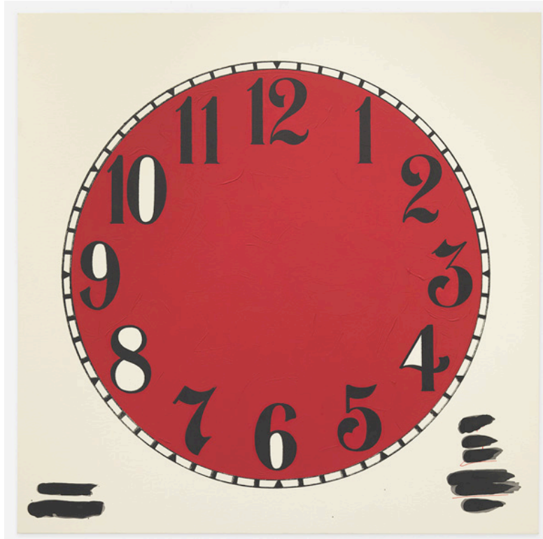
Amanda Ross-Ho, Untitled Timepiece (COCA COLA) , 2017. Gesso, silkscreen, acrylic, gouache, coffee, wine, and graphite on canvas covered panel, 52 x 52 in.

the interiority of another human to empathize with what that feels like, it also performs one of the most vital functions art is capable of.