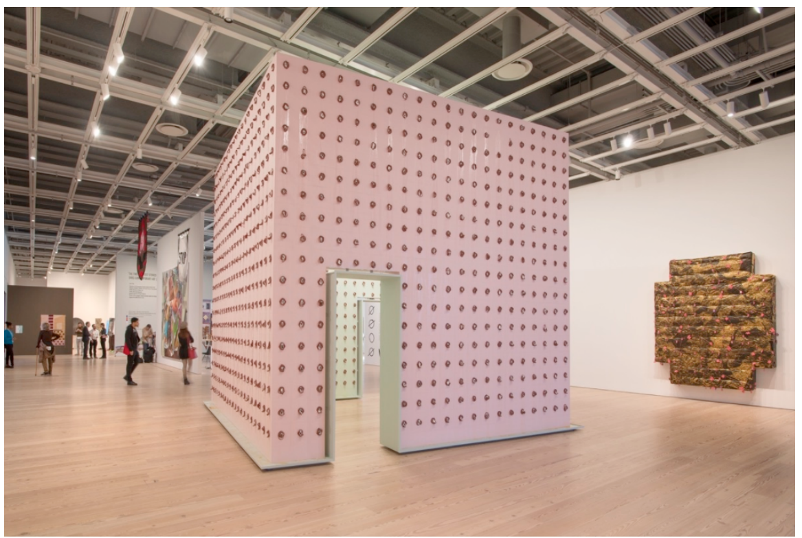
Pope.L, Claim (Whitney Version), 2017. © Pope.L.

1018 MADISON AVENUE NEW YORK 10075 | 534 WEST 26TH STREET NEW YORK 10001 212 744 7400 WWW.MIANDN.COM