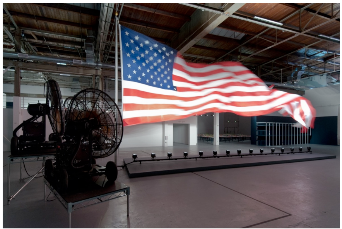
Pope.L, Installation view of Trinket at The Geffen Contemporary at MOCA, Los Angeles, CA. © Pope.L. Photo by Brian Forrest. Courtesy of the artist; Mitchell-Innes & Nash, NY and The Museum of Contemporary Art, Los Angeles.