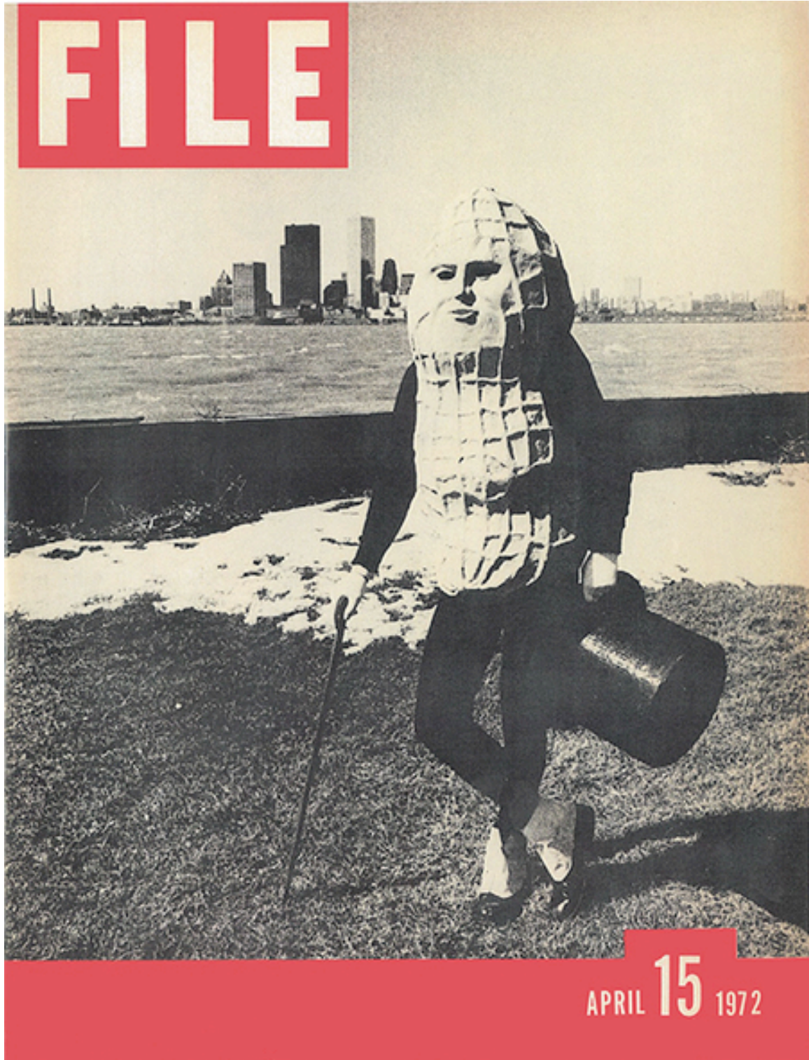
Cover of FILE Magazine, April 1972.

IF GENERAL IDEA arrived on the scene at roughly the same time as Kosuth, they emerged out of a different context: Rightly or wrongly, the group were not included in Lippard's 1973 anthology Six Years: The Dematerialization of the Art Object from 1966 to 1972 , which became the definitive account of Conceptual art. Not unlike Fluxus's makeshift network, General Idea grew out of an adjacent system