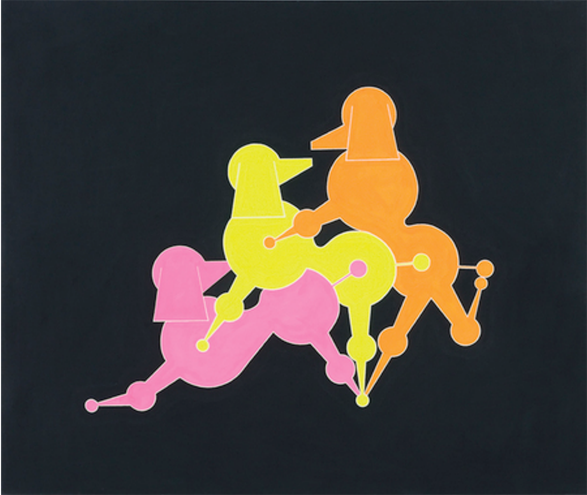
General Idea, untitled, 1984 , acrylic on canvas, 96 × 120". From the ten-part suite Mondo Cane Kama Sutra , 1984.