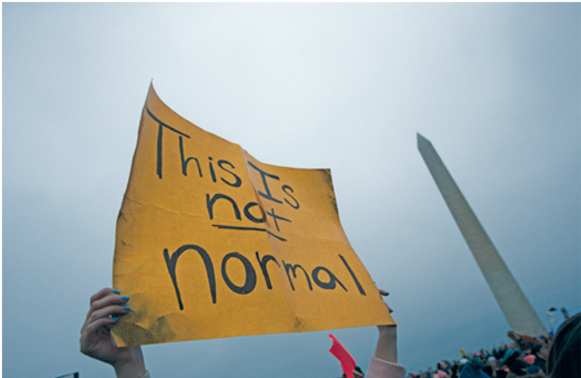
Protest sign, Women's March on Washington, Washington, DC, January 21, 2017.