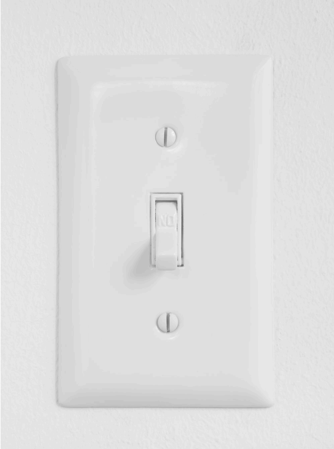
The Beauty You Offer Under the Electric Light, 2016 © Monica Bonvicini and VG-Bild Kunst.