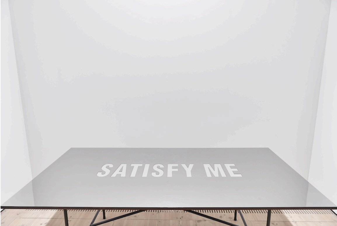
Monica Bonvicini, Satisfy Me Flat , 2009. Installation view, BALTIC Centre for Contemporary Art, Gateshead.