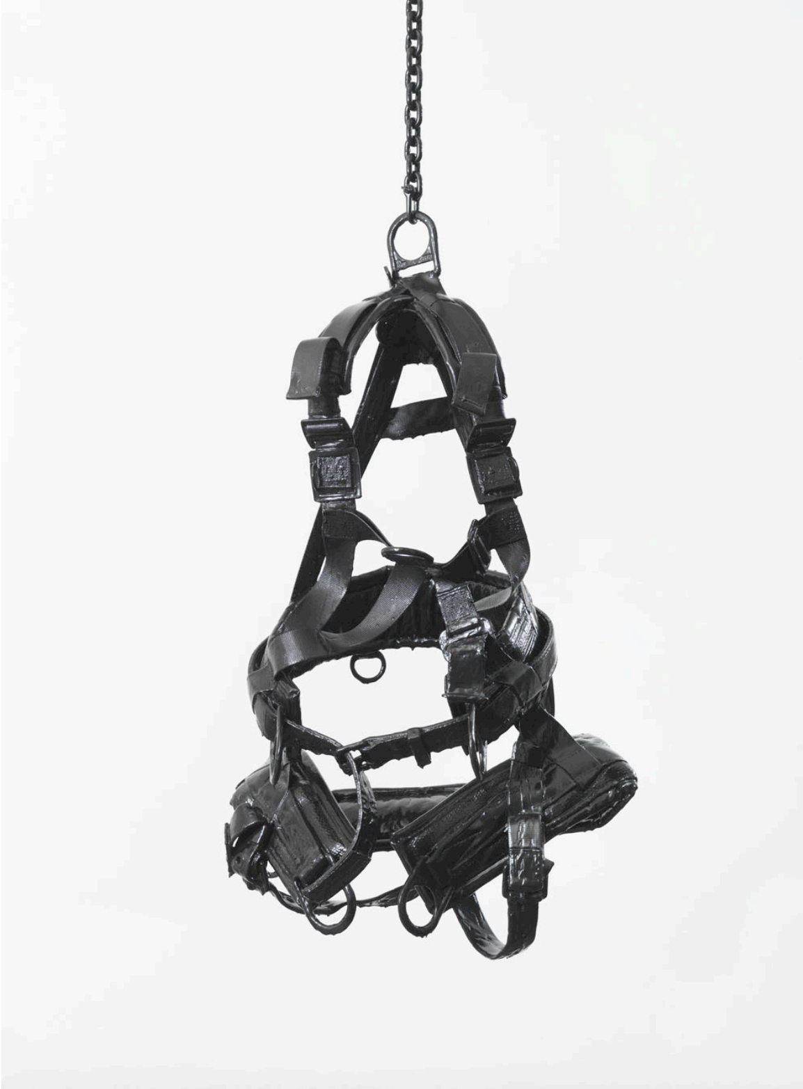
Harness, 2006 © Monica Bonvicini and VG-Bild Kunst. Photo: Jens Ziehe