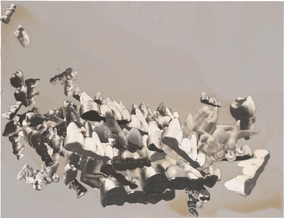
Jay DeFeo, Traveling Portrait (Chance Landscape) , 1973.