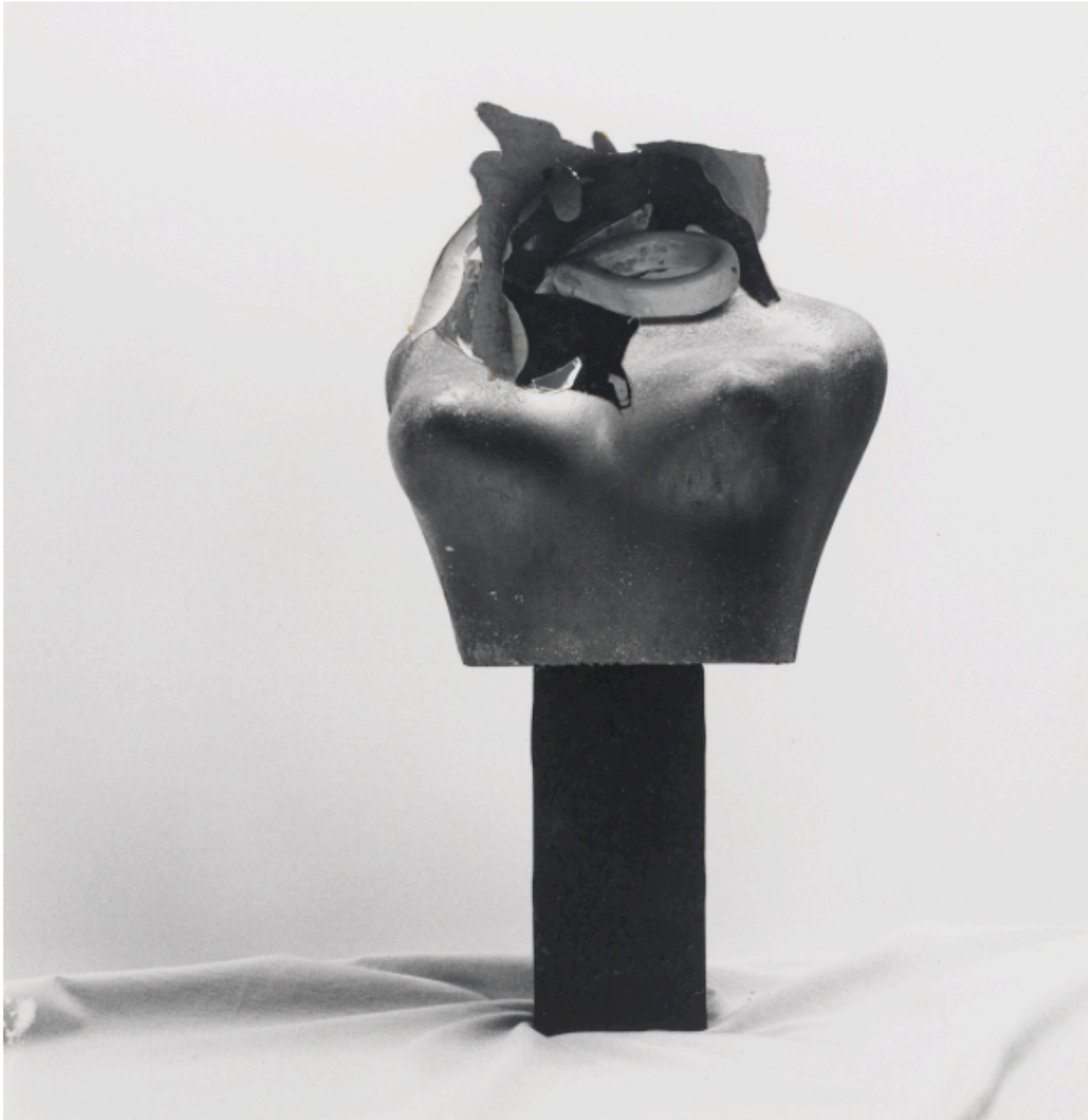
Jay DeFeo, Untitled , 1973. © 2018 The Jay DeFeo Foundation/Artists Rights Society (ARS), New York.