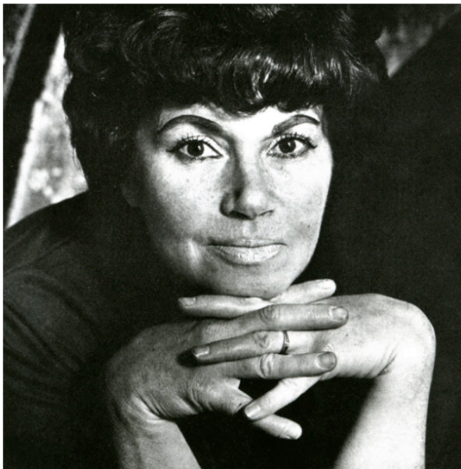
Mimi Jacobs, Jay DeFeo, 1976.