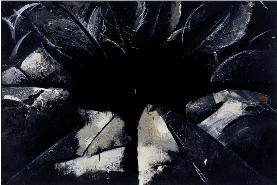
Jay DeFeo, Cabbage Rose , 1975. © 2018 The Jay DeFeo Foundation/Artists Rights Society (ARS), New York.

“The Ripple Effect,” which will travel to the Aspen Art Museum in June after Dijon, is built around four groupings of works based on a looped handle broken off a coffee cup, the leaves of a cabbage plant, a collection of used erasers that DeFeo kneaded into sculptural forms, and a draped tripod that assumes animate characteristics. From each of these models, “DeFeo did works back and forth across media, across scale,” says Levy of these acrylics, photographs, collages, and drawings. “She looked at things from all angles.”