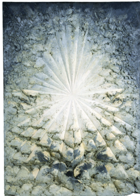
Jay DeFeo, The Rose, 1958-66.

In the career of Jay DeFeo , her astonishing painting The Rose (1958–66) casts a long shadow. Spanning almost 11 by eight feet, it has a primordial-looking surface of oil paint mixed with wood and mica so heavily built up and excavated that it weighs more than a ton. This abstract, sculptural canvas, with radiating vectors that converge at a center point, occupied DeFeo for eight years—consuming her entirely for the last five of those. The Rose acquired mythic status when the