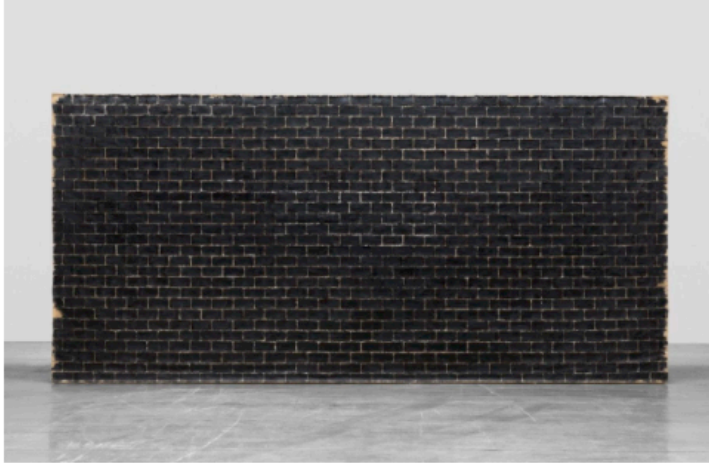
Ugo Rondinone, zweitermärzweitausendundzwölf , 2015. © 2018 Ugo Rondinone. Photo by Studio Rondinone, New York. Courtesy of Galerie Eva Presenhuber, Zurich / New York.