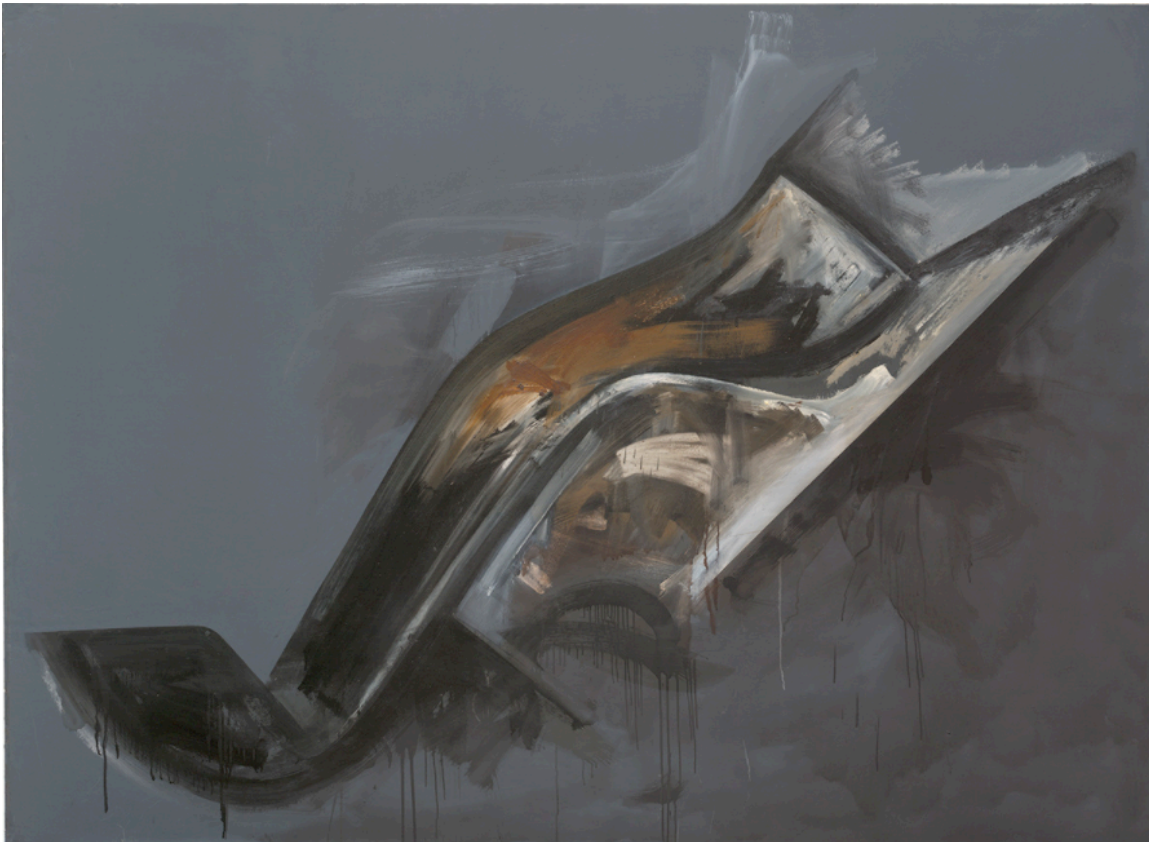
Jay DeFeo, Untitled (Reclining Figure) , 1986. © 2018 The Jay DeFeo Foundation/Artists Rights Society (ARS), New York.

take on the dimensions of an otherworldly landscape. Just as DeFeo had cut up images from girly magazines in the 1950s to make pinwheel collages, the artist now played with cutting up her own photographs, responding to a suggestion that Conner had made in 1973. These photo-collages, such as one of an old-fashioned candlestick telephone with a light bulb in place of its receiver, suggest anthropomorphic creatures.