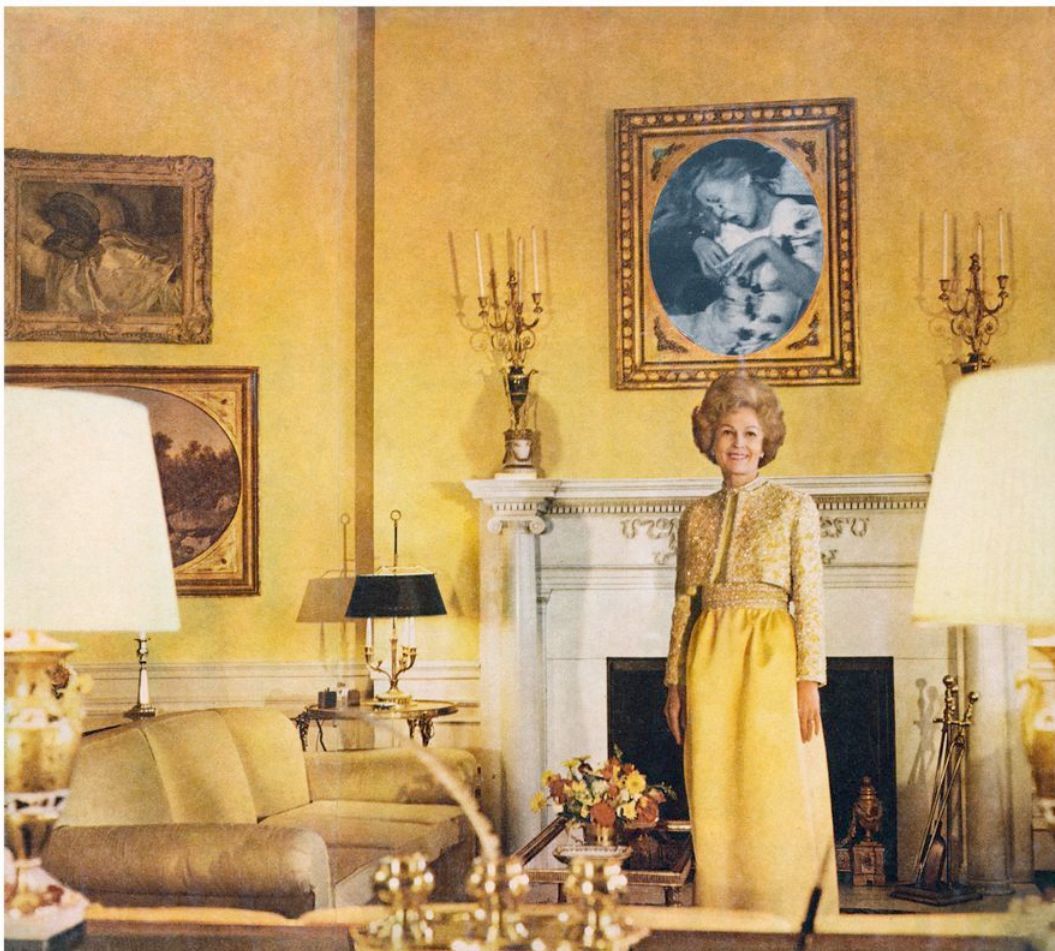
Martha Rosler, First Lady (Pat Nixon), from the series House Beautiful: Bringing the War Home , (around 1967-72) © Martha Rosler. Courtesy of the artist, Mitchell-Innes & Nash, New York and Galerie Nagel Draxler, Berlin/Cologne

Democrats have relied on highly educated professional-class voters and idealistic celebrities to support them electorally, and increasingly on what the Republicans have denounced as identity politics, aiming to empower people beset by social stigma and campaigns of vilification and even criminalisation: African Americans and LGBTQI people, but also (of course) women, and Latinx, and more recently, Asian, South Asian, Native American, and refugee populations. The party has also made efforts to create universal health care and to raise educational and economic levels.