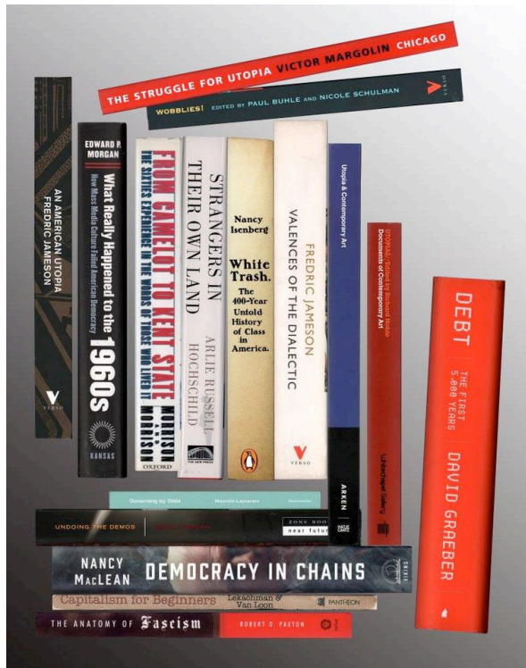
Martha Rosler, Capitalism, Democracy (2018), from the series Off the Shelf (2008-18)

Demographic and labour shifts in the US have produced well-educated city dwellers and suburbanites with professional and other middle-class jobs. But the movement of people to cities has left behind large regions with many poor and working-class white residents with at most a high-school education. Up until the late 1960s, they were generally securely employed, often in factory work.