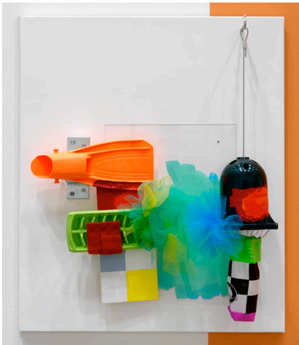
From 'Jessica Stockholder: Stuff Matters'

Thus the happening developed as an intermedium, an uncharted land that lies between collage, music and the theater. It is not governed by rules; each work determines its own medium and form according to its needs.