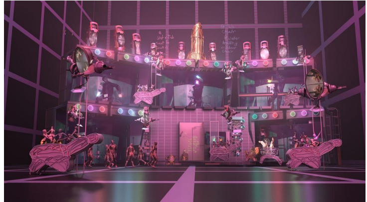
Room for Two , 2019 Mitchell-Innes & Nash