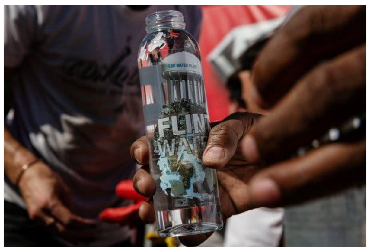
At the end of the performance of "Conquest," crawlers were given water bottles marked "Flint Water" by the artist.

The artist designed T-shirts substituting the S in the Superman logo with a backward C as part of the costume for the participants in "Conquest." He incorporated the blindfold and flashlight used in his 2011 group crawl in Göteborg, Sweden, and introduced music, scent and the relay format for the first time. "It sets up the individual-group dynamic much more vividly," he said.