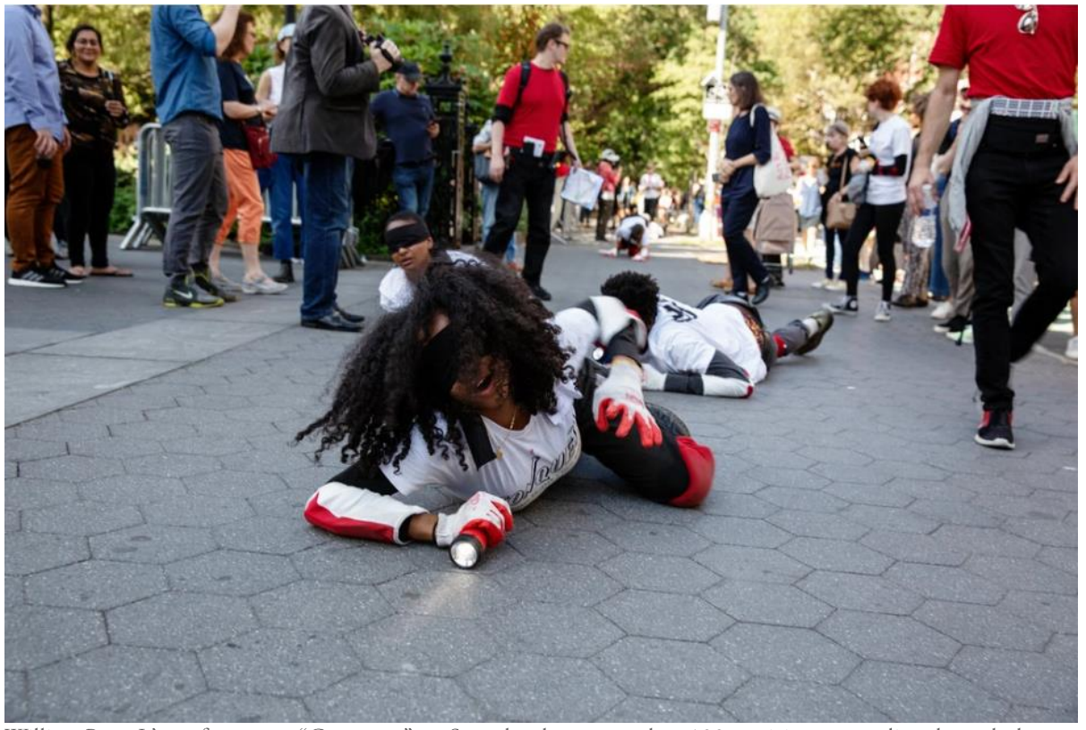
William Pope.L's performance, "Conquest," on Saturday drew more than 100 participants crawling through the streets of Greenwich Village to Union Square.

A communal performance through Greenwich Village kicks off explorations of the artist's career at the Whitney and the Museum of Modern Art.