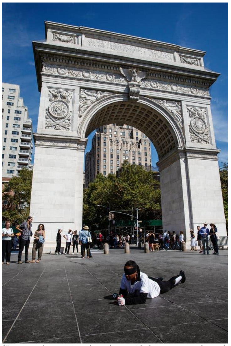
"Everyone who participated goes home with their own story about what happened. It's a fantasy about community and making things O.K., no matter what shadows fall," Mr. Pope.L said of the participants in Saturday's massive group performance, "Conquest," a public act of vulnerability.

among the most expensive and exclusive neighborhoods in the city, for its layered history — the place where blacks could intermarry and own land as far back as Dutch colonization; where artists and poets and musicians congregated in its more bohemian era; where the tragedy of the AIDS crisis was localized.