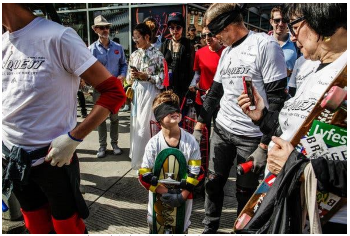
Participants waiting to start the crawl.

The Modern's exhibition consists of 13 seminal performances and related videos and objects by Mr. Pope.L, from 1978 to 2001, which were recently acquired by the museum. At the Whitney, which had bestowed the 2017 Bucksbaum Award and its accompanying $100,000 to the artist, Mr. Pope.L will offer a new immersive sound and sculptural installation, titled "Choir," its roots in the water crisis in Flint, Mich. An upside-down water fountain evoking Jim Crow-era segregation will intermittently gush 800 gallons of water into a tank, its sound amplified and mixed in with 1930s field recordings of African-American choirs singing spirituals.