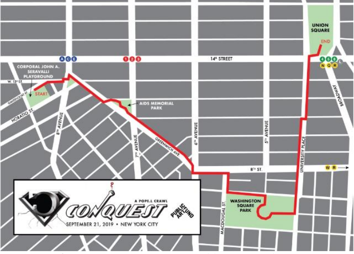
Route map for "Conquest."

"Member," featuring the artist's videos, object, and installations, will open at MoMA on Oct. 21, and the Whitney will debut a new commissioned installation, "Choir," on Oct. 10.