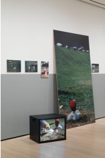
member: Pope.L, 1978–2001, installation view. © 2019 Museum of Modern Art. Photo: Martin Seck.

In 1991, for example, he slathered himself in mayonnaise, a de facto whiteface, perhaps a response to Karen Finley’s chocolate-smearing, for a piece he deigned to call I Get Paid to Rub Mayo on My Body (sadly not in the MoMA retrospective). Another piece, Sweet Desire (1996), actually put him in a kind of tomb—buried in the ground up to his chest on a sweltering summer day, he watched a dish of vanilla ice cream melt for eight hours, unable to access it. As if the sight of a black American man, half buried, risking his life to consume unattainable white ice cream did not sufficiently signify both absurdity and class struggle, the piece also endangered his health. During one performance of Sweet Desire , the MoMA text explains, “he had to be unearthed and hospitalized.” For this work, Pope.L seems determined to keep laughing all the way to the grave.