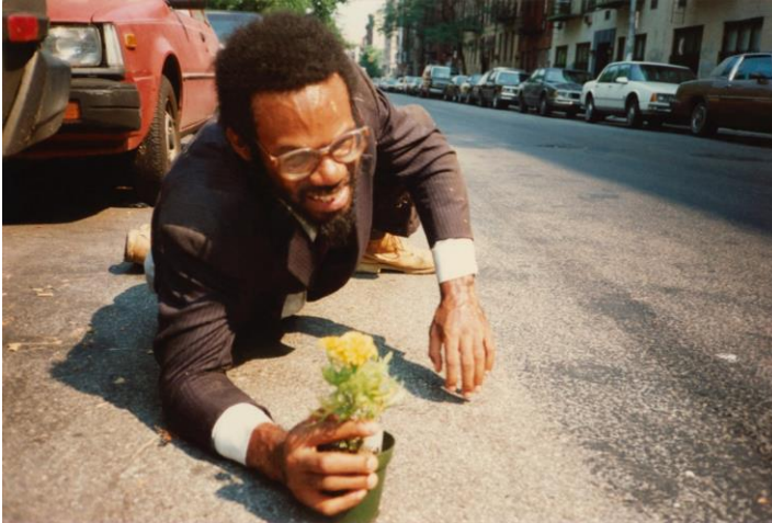
Pope. L, How Much is that Nigger in the Window a.k.a Tompkins Square Crawl , 1991. Digital C-print on gold fiber silk paper, 10 × 15 inches. © Pope. L. Courtesy the artists and Mitchell–Innes & Nash.

Way: 22 miles, 9 years, 1 street (2001–09), he traveled the entire length of Broadway in Manhattan. He’s a scruffy, bespectacled black man, and to scuttle along the pavement he usually dresses in a Superman costume or a cheap suit, lending him the appearance of a civil rights activist gone mad, a homeless person with an agenda, or Cornel West on a really bad day.