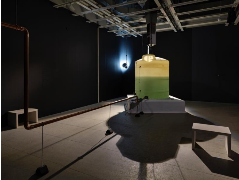
Pope.L, Choir , 2019 (installation view). Thousand-gallon plastic water-storage tank, water, drinking fountain, copper pipes, solenoid valves, pumps, MIDI controllers, electronic timer module, level-detection probe, flow meters, programmable logic controller, wood, scrim, vinyl letters, microphones, speakers, wires, and sound. © Pope.L.

Over in the Whitney's lobby, a soundtrack of echoic drippy water alerts you to the presence of Choir , tucked in the projects room down a little hallway to the right of the elevators and left of the café. In keeping with the marginal status of the space, Pope.L has turned it into something that looks like a dark basement or ship hold. Inside, an upside-down drinking fountain gushes water into a thousand-gallon tank that flows to a system of copper pipes. When the tank fills, a pump starts to recycle the water through the system. Pope.L has attached contact microphones to various parts of the tank so that one can better hear the dripping of the water inside the vat and the water pumps that drive the process.