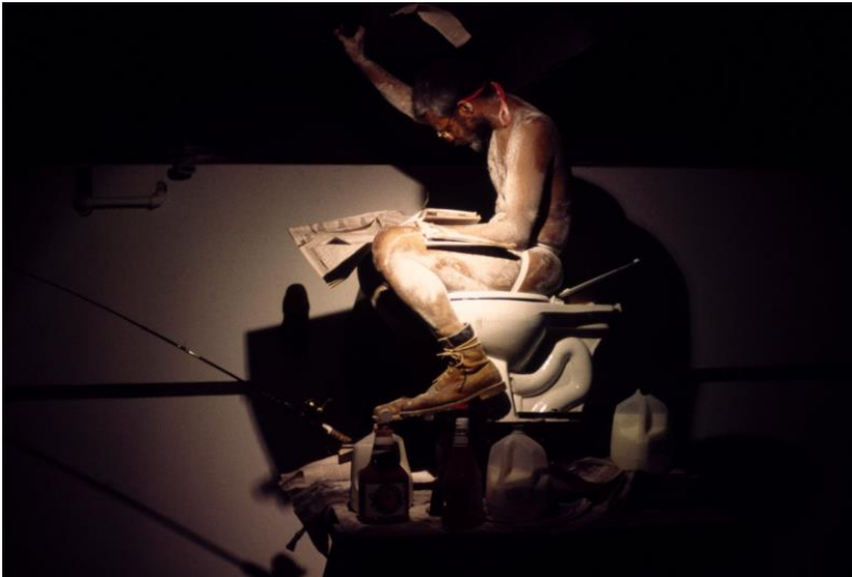
Pope. L, Eating the Wall Street Journal (3rd Version) , 2000. Digital C-print on gold fiber silk paper, 6 × 9 inches.

The show commemorates a selection of Pope.L's performance work from 1978 to 2001 with video installations, props, and photographs, going some way toward integrating his aesthetic into the gallery's design by removing pieces of drop ceiling and drywall, through which the artist has pledged to peep during periodic visits. For the uninitiated, member represents a fabulous, well-organized opportunity to get to know Pope.L's work, but it's hard not to wish that the exhibition had built in more of the artist's raunchy, scatological gestalt. But, you know, MoMA has pearl-clutchers to please.