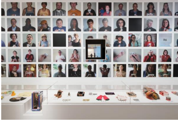
member: Pope.L, 1978–2001, installation view.

social commentary in all of his performances achingly topical—sad for the country, then as now, but a good time to make art.