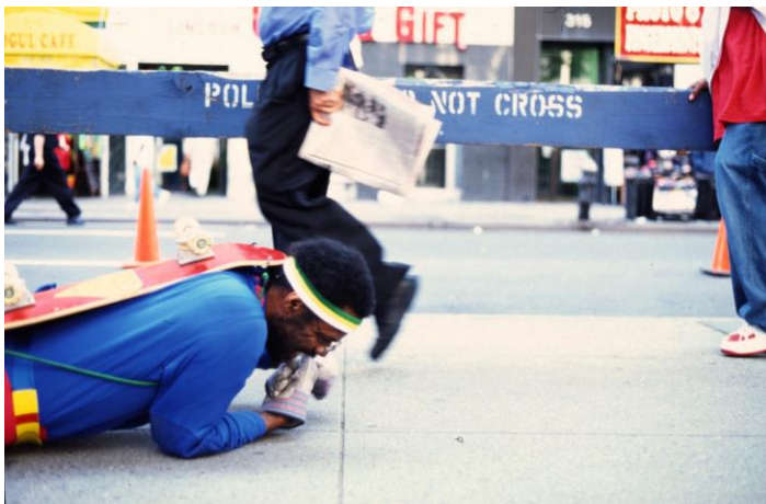
Pope.L, The Great White Way: 22 miles, 9 years, 1 street , 2001–09. Performance. © Pope.L. Courtesy the artists and Mitchell–Innes & Nash.

Crawling Broadway, eating the Wall Street Journal: the performance artist gets a MoMA retrospective, and more.