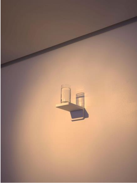
Pope.L, Well (Whitney version) , 2019. Wood, glass, water. Collection of the artist.

This focus on holes links the historical work on view at MoMA with Pope.L's most recent piece, Choir at the Whitney. The massive holding tank is also a hole, one continuously drained and replenished with those 800 gallons of water by a modified, upside-down drinking fountain (itself a potent symbol of American racial segregation) that hangs overhead. The water gushes from the fountain and the cylinder is filled; the pumping mechanism kicks in and the water ekes out through the piping system that snakes through the dimly lit gallery. Choir has its roots in the artist's 2017 project Flint Water , where he collected contaminated water from taps in the beleaguered city, and bottled and sold it at an ad hoc storefront in a Detroit gallery. The proceeds were donated to organizations working to alleviate the water crisis in Flint, a town with a majority Black population, and one of the most egregious examples of mass, government-directed harm perpetuated on non-white bodies in recent American memory. In the galleries of Choir cryptic messages are etched into the walls, barely visible but chilling when spotted in the muted light. HLLOW WTR , reads one. NDVSBL WTR , reads another. Alone on one wall, the viewer confronts the message NGGR WATER .