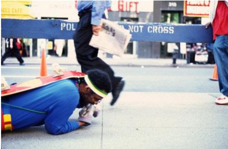
Pope.L, The Great White Way, 22 miles, 9 years, 1 street , 2000–09. Performance.