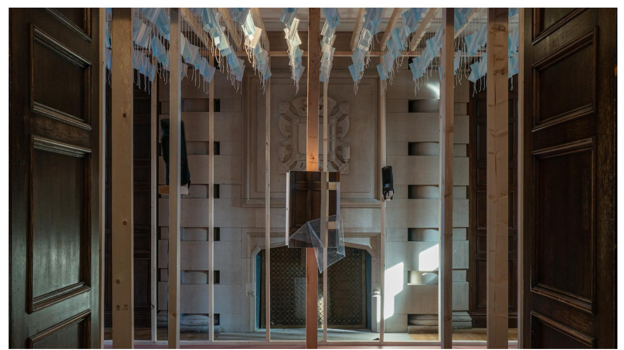
The COVID-19 pandemic casts a shadow over the exhibition, which contains allusions to the crisis with a degree of directness that is unusual in Pope.L's work. Visitors enter the gallery under a literal cloud of masks, and seeing the works requires opening mirror-clad medicine cabinets with blue latex gloves.