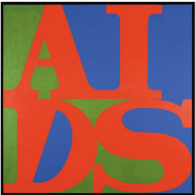
AIDS (1987), General Idea. © General Idea.