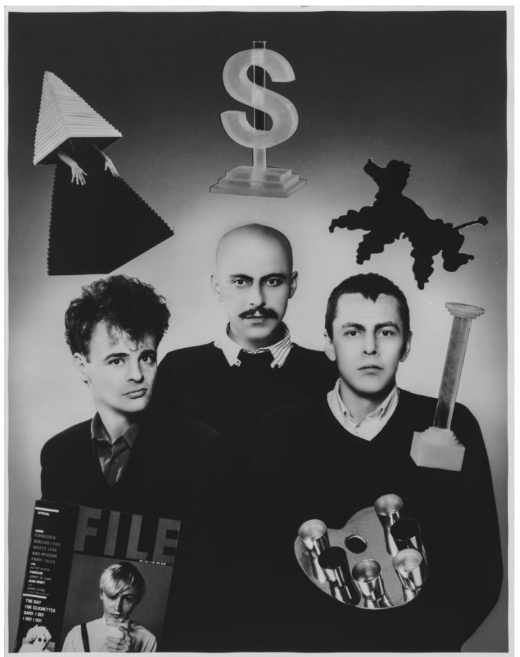
Self-portrait with Objects (1981–82), General Idea. © General Idea. Photo: NGC