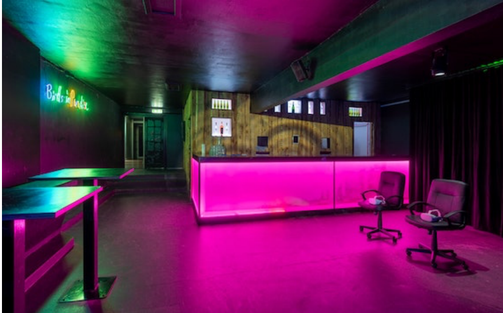
Installation view of Jacolby Satterwhite's A Feeling of Healing at the Museum of Contemporary Art, Denmark, 2022.

There is a chill in the air of a disused nightclub in Roskilde, about thirty kilometers outside of Copenhagen. The floors are sticky, as if the dance floor has only just been vacated. For the American artist Jacolby Satterwhite, the club is “a strange cave, where intellectuals come together when they are the most unintellectual, but [also] the most beautiful and kindred.” Satterwhite’s exhibition in Roskilde, hosted by the itinerant Museum of Contemporary Art, centers upon the healing powers of dance and the nightclub, where marginalized groups have the freedom to transgress, inhibitions are lost, artists incubate, and Satterwhite spent so much of his youth.