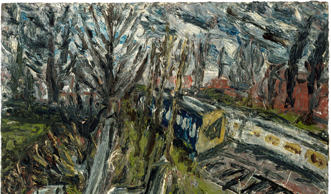
Leon Kossoff's Between Willesden Green and Kilburn, Winter Evening, 1991, oil on board. (Private Collection. Leon Kossoff Estate)