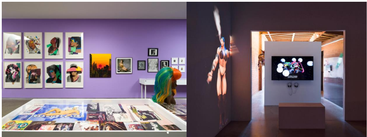
‘Make Me Feel Mighty Real: Drag/Tech and the Queer Avatar’, 2023, installation views.

Echoing the maximalist mantra of Sylvester’s 1978 disco track from which it draws its name, ‘Make Me Feel Mighty Real’ materializes in drag, morphing from archival presentation to intimate, internet-age mid-section before capping out as a queer nightclub for contemporary creations, complete with a tinsel-encrusted stage. Across the walls, a dreamy wash of postinternet purple – buzzing lavender like a backlit screen – weaves these worlds together.