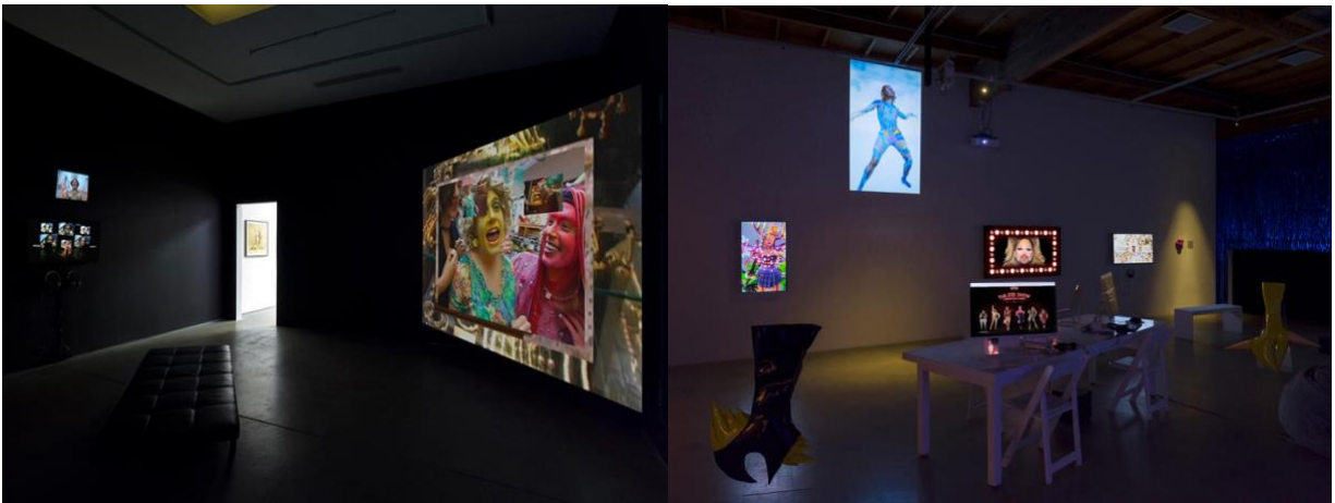
'Make Me Feel Mighty Real: Drag/Tech and the Queer Avatar', 2023, installation views.

Next, the exhibition bifurcates into two blackout zones: one hosts a trio of postinternet videos; the other an intimate homage to AVALON – one of LA's legendary queer nightclubs. In the former, viewers can slip on headphones to enter the spectacular world of Dynasty Handbag's Garbage Castle (2019), a soapy satire critiquing Big Tech's commercialization of the home via a speculative P2P rental site called 'Air Pee-n-Pee'. Next door, two video works by the collective behind AVALON offers a more generous view of the home, with 3D scans of their domestic space and a brain-shaped collage of inspirations serving as an intimate portrait of everyday life.