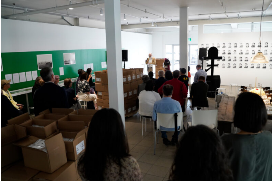
Performance still from AA Bronson, A Public Apology to the Siksika Nation , 2019, at the Toronto Biennial of Art.