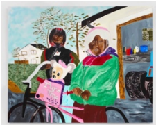
MARCUS LESLIE SINGLETON Shea Butter Babies , 2023 Oil, spray paint and glitter glue on panel 48 by 60 in. 121.9 by 152.4 cm. (MI&N 18774)