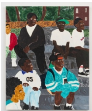
MARCUS LESLIE SINGLETON Discovery Park , 2023 Oil and spray paint on panel 60 by 48 in. 152.4 by 121.9 cm. (MI&N 19006)