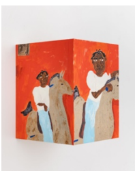
MARCUS LESLIE SINGLETON Cisco , 2023 Oil on three joined wood panels 16 by 12 by 12 in. 40.6 by 30.5 by 30.5 cm. (MI&N 19061)