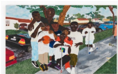
MARCUS LESLIE SINGLETON Razor , 2023 Oil and spray paint on wood panel Diptych, overall: 60 by 96 in. 152.4 by 243.8 cm. (MI&N 19036)