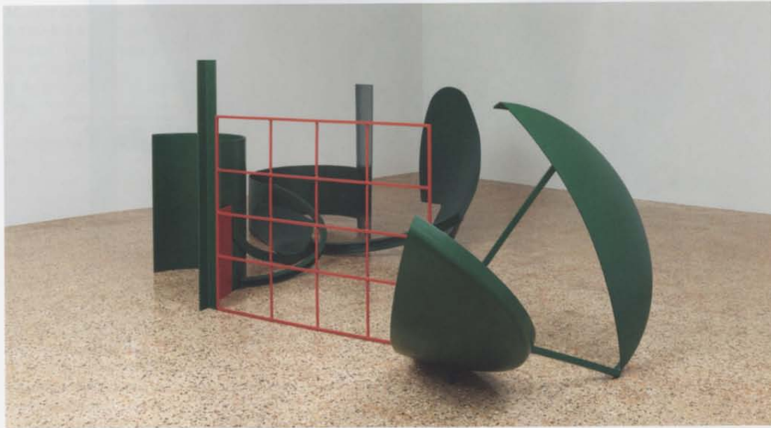
Garland , 1970. Painted steel, 55 x 169 x 148 in.

abstract works that followed. We included sculptures from the '60s and '70s like Hopscotch (1962) and Garland (1970). Neither one has been seen much, so it was interesting to include them.