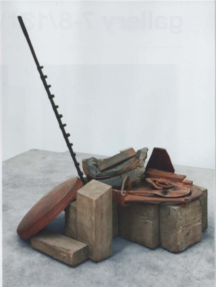
Death of Hector , from the "Trojan War" series, 1994. Stoneware, pinewood, and steel, 66 x 48 x 53 in.

JJ: I remember once being with Ken Noland at Bennington, and he said, "Let's go look at something I've been fascinated by." He took me down to a nearby river and said, "Now look in the water, just look in the water." When I said, "It doesn't look like there are many fish," he responded, "No, no, just look into the water." And I realized what he was saying: "Don't look for objects. Don't look for a thing, just look." Some of your works, including the "Trojan War" series (1995–99) and Chapel of Light (2008), have very strong figurative references. It seems, however, that figuration has left your recent work, has moved away, but the emotional context is still there. Is that possible?