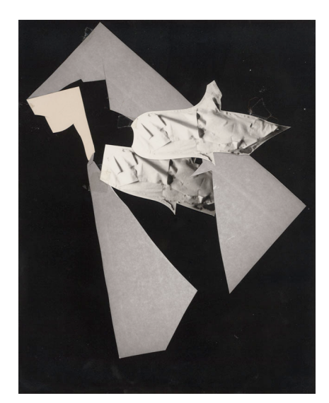
Jay DeFeo, "Untitled" (1975), photo collage with photocopy, 9 15/16 x 7 15/16 in (25.2 x 20.2 cm)

gestures hemmed into a slick form. The enigmatic shape at the center has the form and violence of a bullet. The acrylic is thin but complex, and gains literal depth by way of collage and an embedded staple, leftover from her masking process. Another photograph, this one from 1973, reveals her "model" for "Lotus Eater": a candlestick telephone with a light bulb stuck in the receiver. Meanwhile two collages claim shards of the 1975 photograph and put them to surreal ends. The curators here take full advantage of DeFeo's archival impulses; this is just one of the many genealogies they trace. DeFeo had cultivated a light-sensitive eye long before she started working with film. In a 1986 lecture she spoke about the raking light that would illuminate "The Rose" as it blocked her central bay window, enhancing the paint's texture. "That edge became very important to me," she said. Despite the thinness of its acrylic paint, a work like "White Shadow" (1972) shows her unwavering interest in that raking light in its eclipse-like form. And the photocopier, with its steady scan and thin, unskilled printing, may seem completely antithetical to DeFeo's technique, but there are a slew of rarely seen photocopy works on view here. In fact, the process of the machine's visualization is not unlike the positioning of "The Rose": the subject — whether it's a cup or a tissue box — blocks the light. DeFeo's art is in the way light describes the edges.