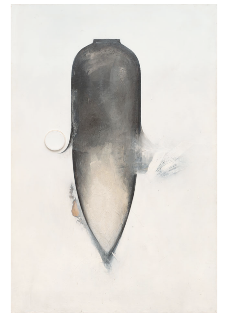
Jay DeFeo, "Lotus Eater No. 1" (1974), acrylic with collage on Masonite, 72 1/2 x 48 1/2 in (184.2 x 123.2 cm) (click to enlarge)

She may have turned to photography out of frustration with acrylic paint, which she was forced to use due to limited finances and space. In a 1975 journal entry she wrote of her "strange paint experiments – no doubt will ultimately frustrate a restorer. Acrylic and oil do mix if you use force! Have been trying everything to give the acrylic body , first egg shells, now bisquick & cornstarch." The quote betrays not only her vision of her own deserved legacy, but also her sense of humor and intense willingness to experiment and adapt.