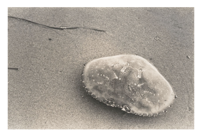
Jay DeFeo, "Untitled" (1972), gelatin silver print, 4 3/8 x 6 7/16 in (11.1 x 16.4 cm) (click to enlarge)

This is <u>Bruce Conner's take</u> on the 1965 removal of "The Rose" (1958–66), Jay DeFeo's infamous and monumental painting, after its eight-year creation in her Fillmore Street studio. But not until more than halfway through the seven-minute film do we actually see the artist herself, faceless as she looks down from the fire escape, swinging her legs nervously. Cut and she's dwarfed by her creation. Cut and she's lying atop the crated artwork as if waiting to be carried down with it. Cut and the men hoist "The Rose" directly out the wall with a crane. Cut and the men sit satisfied in the back of the truck that carts it away, while she remains in the apartment, an unimpressive figure blocking the light of the 12-foot hole.