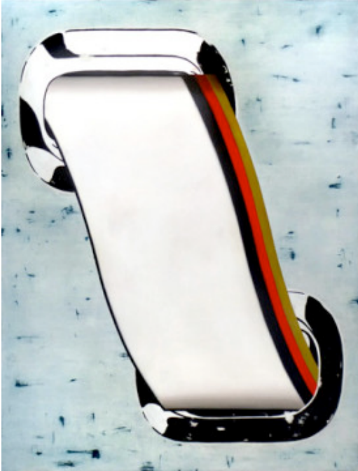
Anne Neukamp, Latz , 2014. Oil, acrylic and tempera on canvas, 78 3/4 by 59 inches. Courtesy of the artist and Mitchell-Innes & Nash.

Formal echoes and conceptual conversations are found repeatedly between paintings and sculptures throughout the exhibition, for example Diane Simpson's 2011 sculpture Neckline (extended) . Its vertical, rectangular fiberboard planes surround an empty triangular section at center, lined with gray and reminiscent of a revealing dress or blouse. There are arm-like extensions at either side, made of curved, linear aluminum. The sculpture could be a distant relative of the geometric figures found on a Dessau Bauhaus theatre set of the 1920s. Anna Neukamp's Insert (2014) hangs behind this sculpture and to its right side. Insert features just that: the