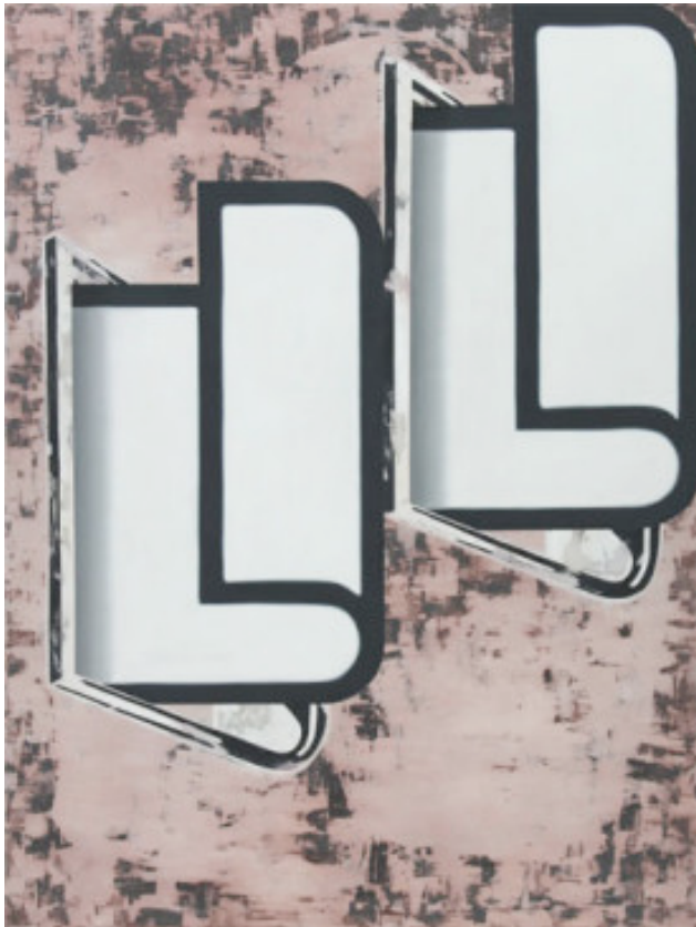
Anne Neukamp, Crook , 2014. Oil, acrylic and tempera on canvas, 78 3/4 by 59 inches.

Simpson’s exquisitely invented objects present both an acute sensitivity to aspects of construction and specificity of materials. The titles orient the viewer to one source of the form, now reinvented as an object independent of function. The potential readings, given the hybrid quality of her sculptures, include historical, sociological, psychological or architectural. Take Mesh Bonnet (1992), which is a basket- or bonnet-like object made of pinewood, cotton mesh and waxed linen thread: suspended from above by the thread, the bonnet is now transformed and suggests anthropomorphic, historical and architectural referents. What would have been a chinstrap appears to be held by two downward-reaching arms. The body of the sculpture forms an enclosure on the shelf upon which it sits, like a shelter or canopy. Formalist and Duchampian, Simpson’s appropriation and nuancing of familiar forms enrich an understanding of inherent complexity in objects of common (or once common) use. The finely crafted construction retains an essence of the sourced object, which is simultaneously heightened, refined and expanded.