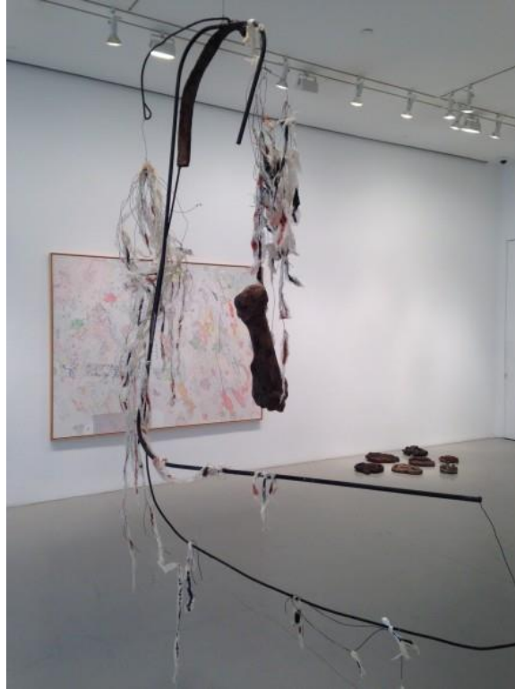
Nancy Graves (Installation View)

Realistically replicated enough for average viewers to assume what they are looking at is a camel head, Head on Spear is a good example of Graves' interest in complicating the separation between the natural and the artificial, bringing back the argument to the duality between nature and art. Her inflections of the human, and the violent forces that they often inflict on the natural world, is implied through her relief, both in its strategy of exhibition and its title. The gallery is tied up in the work itself, and the environment the work populates makes much of its hybridized space. Nancy Graves Is On View at Mitchell-Innes & Nash Through March 7, 2015.