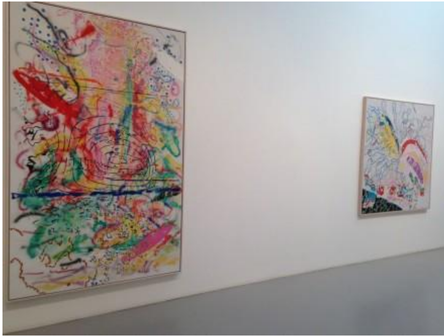
Nancy Graves (Installation View)

Graves' travels to different parts of the world, particularly her journeys to Morocco, Egypt and Peru were an influential period in her biography, shortly after her graduation from Yale with an MFA in painting. In relation to these travels, camels, with their mysterious and hybrid forms, evolved into an important source of inspiration for the artist who regarded them as the 'unworldly compositions of the illusion and the reality'.