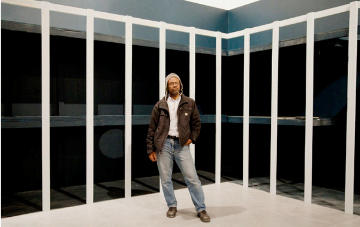
William Pope.L at the Museum of Contemporary Art in Los Angeles.

“That is one possible fate of America. And some people believe we are already there,” said Mr. Pope.L, 59, who had flown in from his home in Chicago for the day to join a small installation crew and still looked like he was dressed for a Midwestern winter, wearing a black windbreaker and a gray knit cap.