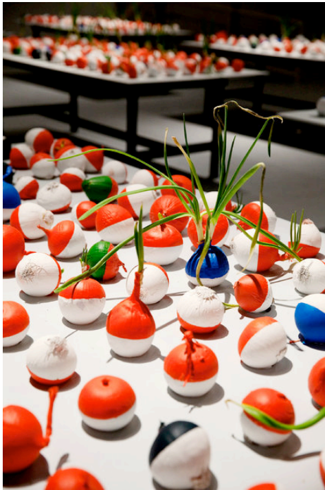
A detail of an installation at the Los Angeles exhibition that includes hundreds of painted onions.

show at the Studio Museum in Harlem, taught him how to make do with very little: “Have-not-ness permeates everything I do,” he once said.