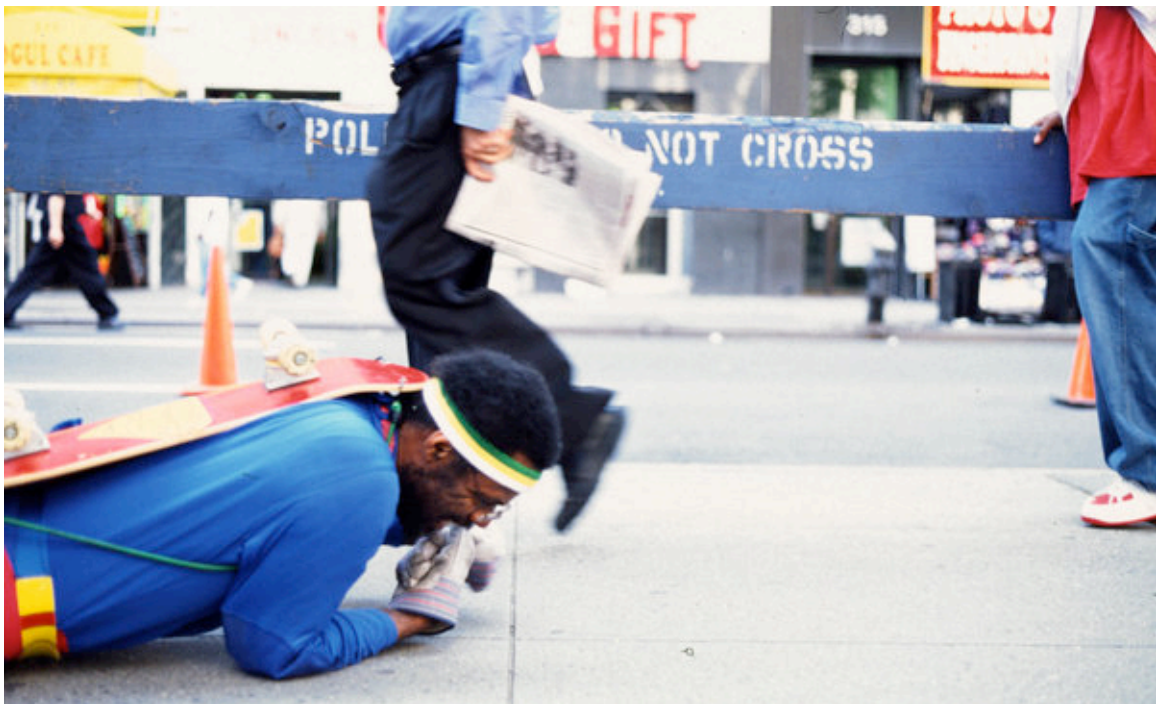
William Pope.L crawling up Broadway in 2001.

More approachable and less confrontational in conversation than his art might predict — he uses a lighthearted “toodleloo” for “see you later” — Mr. Pope.L said he would not be upset if people interpreted the torn flag, which originated in 2008 in a smaller form in Kansas City, Mo., as a response to accusations of racial profiling and police brutality in recent months.