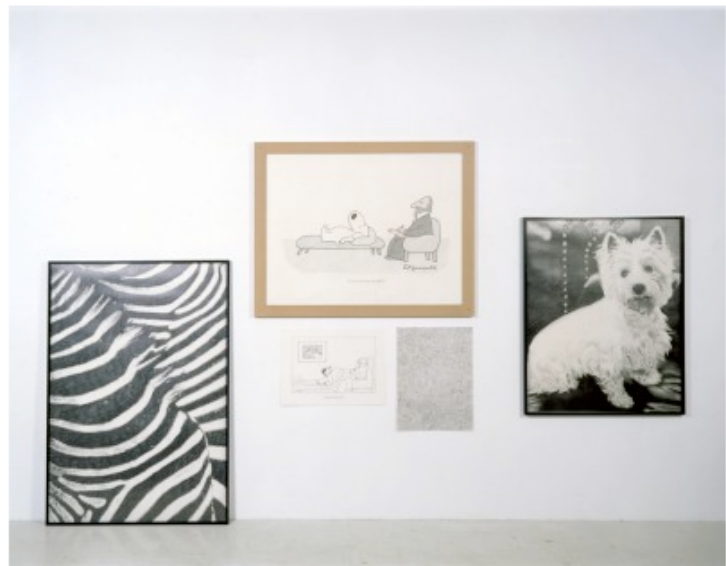
— Karl Haendel, Shrink , 2005, five drawings of pencil on paper, dimensions vary (artwork © Karl Haendel)

practice of arranging the finished drawings, Haendel has exhibited his slide collection as ever-changing room-sized installations, in which slide projectors mounted at varying heights and distances from the walls project edited selections from his archive. xvi With each slide carousel organized by the artist according to