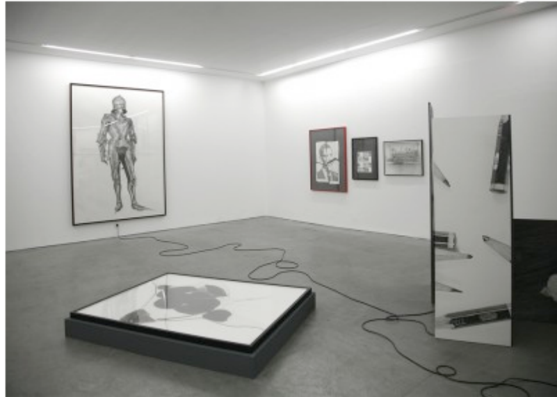
— Karl Haendel, Knight #2 , 2010, pencil on paper, 103 x 74 in. (261.6 x 187.9 cm), incorporated into an installation of the artist's work, Yvon Lambert Gallery, Paris, 2011 (artwork © Karl Haendel)

recognizable as the same knight. Between June 2010, when Haendel first started making the knights, and December 2012, when Longo's "Sir Adam" emerged, Haendel's knight drawings had been shown in Basel, Paris, Naples, New Orleans, and New York. i