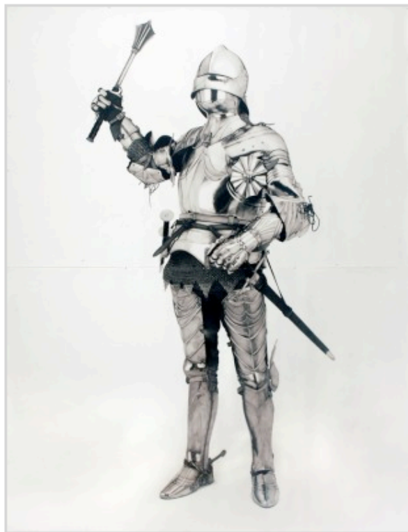
Karl Haendel, Knight #1 , 2010, pencil on paper, 103 x 79 in. (261.6 x 200.6 cm) (artwork © Karl Haendel)

See, Haendel had already made a life-size knight drawing from the same source image in 2010. In fact, Haendel had made a whole series of knight drawings—eight of them between 2010 and 2011 titled Knight #1–#8 . Rendered in graphite pencil on pages measuring 103 inches by a range of 74–83 inches, Haendel’s eight knights are faithful, scaled-up reproductions of four photographs of full-body armor suits characteristic of medieval and Renaissance Europe, drawn first after the original images and then each redrawn in a second version flipped on its vertical axis. Longo’s Adam was thus the doppelgänger not only of Haendel’s Knight #2 but also his Knight #6 , who faces in the opposite direction but is still