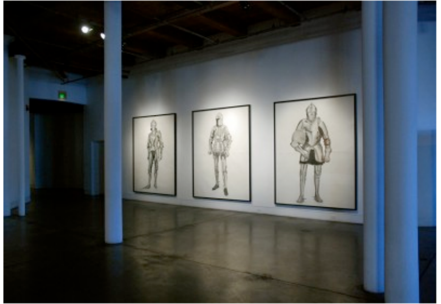
— Karl Haendel, installation of Knight drawings at the Contemporary Arts Center New Orleans as part of Prospect.2 , 2011–12. Left to right: Knight #6 , Knight #4 , and Knight #5 (all 2011) (artwork © Karl Haendel)

acclaimed 2014 series Gang of Cosmos , in which his typical grandiose scale returns. This body of work includes twelve exquisitely rendered graphite drawings of famous Abstract Expressionist canvases, some of which are enlarged even further beyond their already heroic true size. Executed with close access to the paintings, Longo's stunning renditions are so detailed that they depict the texture of the canvases and the differing viscosities of paint. xi