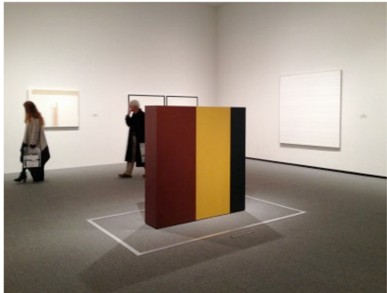
— Anne Truitt's Knight's Heritage , 1963, acrylic on wood, 60-3/8 x 60-3/8 x 12 in. (153.4 x 153.4 x 30.5 cm), installation view, National Gallery of Art, Washington, DC, 2012 (artwork © Estate of Anne Truitt)

One" considered Haendel's early project of reconstructing works by the minimalist sculptor Anne Truitt, including Knight's Heritage (1963). This second text examines Haendel's confrontation with another artist of an older generation, the early postmodernist Robert Longo.