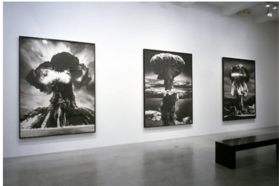
— Robert Longo, Sickness of Reason , installation view, Metro Pictures, New York, 2004 (artwork © Robert Longo)

The gesture effectually made some sense of Longo’s enigmatic images (now we know why they are falling), which had originally withdrawn their meaning in a characteristically obscure mode of postmodernist