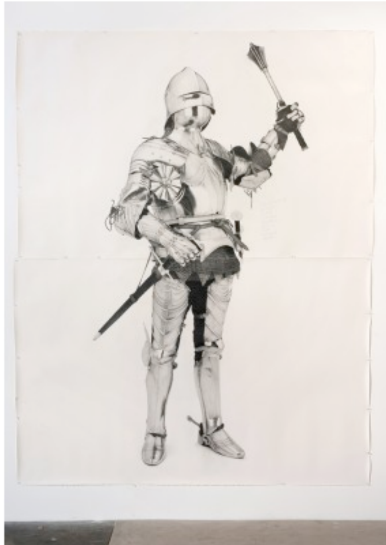
— Karl Haendel, Knight #8 , 2011, pencil on paper, 103 x 79 in. (261.6 x 200.6 cm) (artwork © Karl Haendel)

Prince, for one, having been ascribed a “deeply personal vision” that betrays “a uniquely individual logic”—this reassertion of authorship is plain to see. xiv If these artists were celebrated in an earlier time for revealing expressionist modes of artmaking to be utilizing, as Hal Foster writes, “a language so obvious we may forget its conventionality and must inquire again how it encodes the natural and simulates the immediate,” over thirty years later, in a time when those critical revelations have themselves become canonical, we must now parse how individual appropriation practices differently recode the cultural and its always-already mediated nature. xv