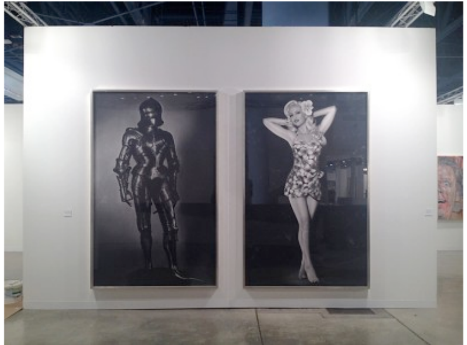
Robert Longo, Untitled (Adam and Eve), 2012, installation view, Metro Pictures booth, Art Basel Miami Beach, 2012 (artwork © Robert Longo;)

deeply emotional, surreal, odd, strange, and wonderful. He felt a strong desire to put his arms around the sculpture and embrace it. In a sense he had already seen the work before, but of course not really. Knight's Heritage was deeply familiar and at the same time not familiar at all. It was an uncanny experience.