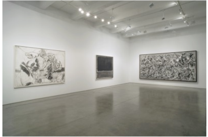
— Robert Longo, Gang of Cosmos , installation view, Metro Pictures, New York, 2014 (artwork © Robert Longo)

Here was Longo placing himself, in a rather uncomplicated and unironic fashion, in line with a longue durée of modern masters by absorbing their work very literally into his practice. It was an exercise remarkably similar to Haendel's efforts to reconstruct the work of Truitt and to ape the work of Longo—except, crucially, for its lack of conceptual complexity and self-criticality. The 2013 exhibition