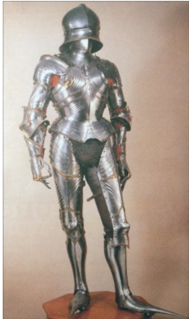
— An example of 16th-century Maximilian armor.

protecting against vulnerability that also delimits experience and feeling. ii His first knight was drawn from the only high-resolution image of full-body armor that he could find online. It turns out that finding high-quality images of medieval armor is challenging, not only because authentic full-body metal armor is rare, but also because the armor's reflective surfaces make it difficult to photograph. Haendel began searching for illustrated books on armor in libraries. He rented a full-body armor suit from a costume shop in North Hollywood specializing in historically accurate re-creations for film and television, and he wore the suit in a 16mm film made in 2010 that is reminiscent of the work of Jack Goldstein. Having learned that high-quality photographs of complete suits of medieval armor are nearly as rare as the books in which they're published, he also borrowed one of the shopkeeper's books and photographed the images in it. This is where he found the image he drew in Knight #2 , unmistakable for the figure's toe coverings, which