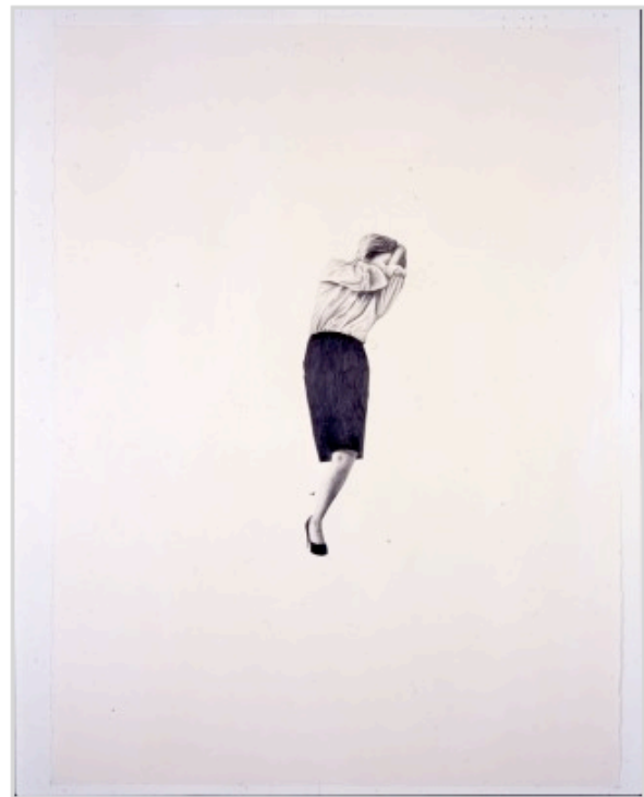
Karl Haendel, Little Legless Longo #4 , 2004 pencil on paper, 30 x 22 in. (76.2 x 55.8 cm) (artwork © Karl Haendel)

It seems unlikely, not only because of all the aforementioned intricacies of this genre of images, but also because of another series of drawings reproduced from found images that Haendel had made in 2004, the Little Legless Longos .