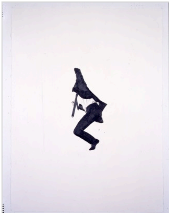
Karl Haendel, Little Legless Longo #2 , 2004, pencil on paper, 30 x 22 in. (76.2 x 55.8cm) (artwork © Karl Haendel)

double the length of each foot by extending outward in a single, bayonet-like talon, and, most especially, for the curious position of the left hand: the forefinger and thumb are joined to form a dangling “A-OK” sign. Only after Haendel had completed Knight #2 did the source image happen to make its way onto the Internet, in April 2012 as part of a post on a medieval enthusiast’s blog. iii Given the multitude of images that come up in Internet searches for knight’s armor, it is remarkable that Longo could have arrived at the same image for his Adam without knowledge of Haendel’s Knight #2 . Could he or a studio assistant have happened upon the exact same book on armor as Haendel?