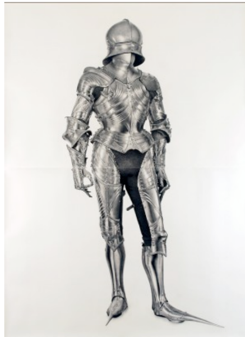
— Karl Haendel, Knight #2 , 2010, pencil on paper, 103 x 74 in. (261.6 x 187.9 cm) (artwork © Karl Haendel)

Since the rise of appropriation in American art of the 1980s, the strategy has become so commonplace as to evade continued examination as a unique vein of artistic practice. At the same time, recurrent intellectual property battles around appropriative gestures in contemporary art have threatened its viability, giving rise to College Art Association's important report published in February 2015, the Code of Best Practices in Fair Use for the Visual Arts. This three-part essay on the work of Karl Haendel, an LA-based artist best known for his arrangements of meticulously rendered drawings of found photographic imagery, connects three moments in his early career related to issues of artistic and cultural heritage and power. The first two episodes directly involve knights.