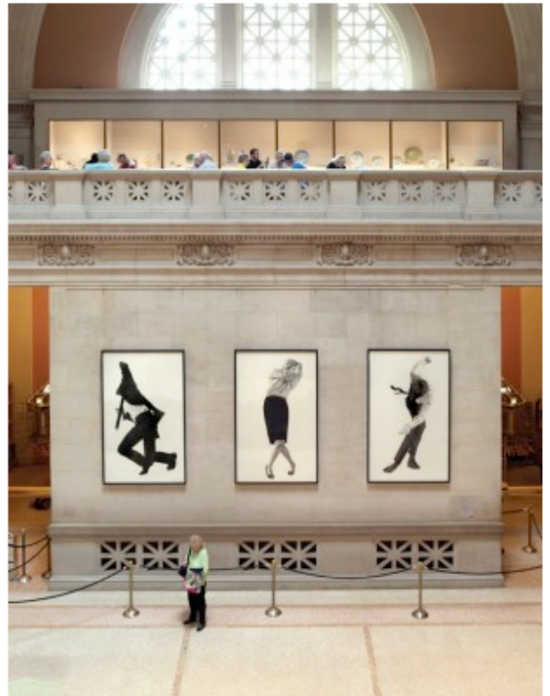
— Robert Longo, Men in the Cities (Triptych) , installation view of The Pictures Generation, 1974–1984 , Great Hall, The Metropolitan Museum of Art, New York, 2009 (artwork © Robert Longo)

Longo's, it is to this body of work in particular, not only in terms of its form but also in its staging and intended meaning. As a recent catalogue essay describes Men in the Cities , "While many of Longo's works portray figures, he does not consider the works to be figurative. Instead, he thinks of figures such as those in Men in the Cities as 'abstract symbols,' and 'more like Japanese calligraphy or