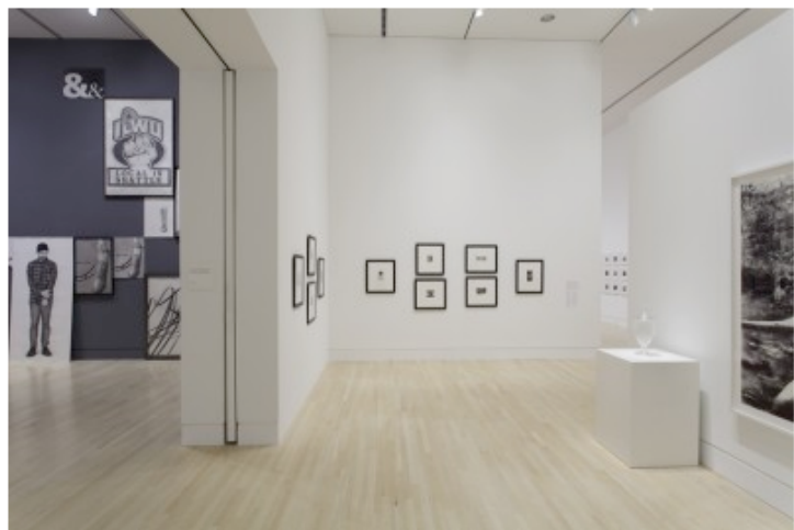
— Graphite , installation view showing the work of Karl Haendel (left) and Robert Longo (right) on opposite sides of the same wall, Indianapolis Museum of Art, Indianapolis, Indiana, December 7, 2012–June 2, 2013 (artwork © Karl Haendel; artwork © Robert Longo)

representation or authorship had all but evaporated. Longo was still redrawing images in series, but his choice of subject matter along with the drawings' craftsmanship and scale now seemed to celebrate the awesome beauty of the sublime image, with each presented as a singular masterpiece. At age fifty, Longo seemed already to have entered what Edward Said has theorized as an artist's "late style" — grandiose, irascible, and intransigent. viii By 2004 Longo had drawn nuclear explosions, tidal waves, rose blossoms, and pistols; soon would come sharks,