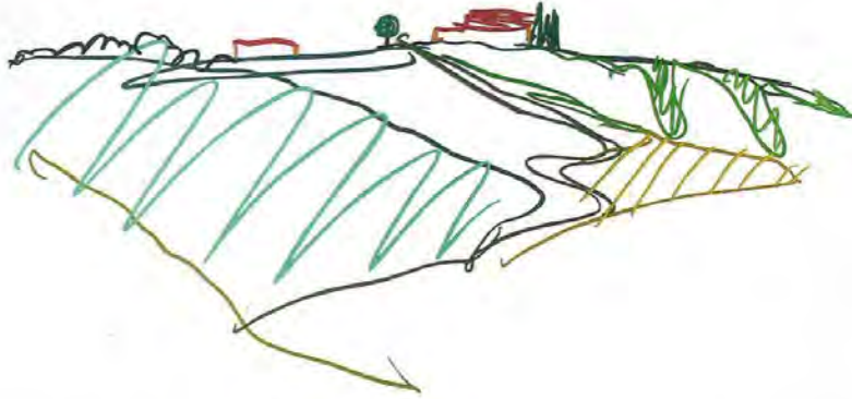
Previous spread, clockwise from left: Tom Wesselmann, Bedroom Painting #38 , 1976, oil on canvas, 84 x 97 inches; Three Step , 2003, oil on cut-out aluminum, 84 x 80 x 21 inches; Tom Wesselmann in front of Great American Nude #16 , 1961. This page, from top: Quick Sketch from the Train (Italy) #2 , 1987, enamel on cut-out steel, 48 x 100 inches; Seascape #10 , 1966, molded Plexiglas painted with gripflex, 44 1/2 x 38 1/2 x 1 3/4 inches.