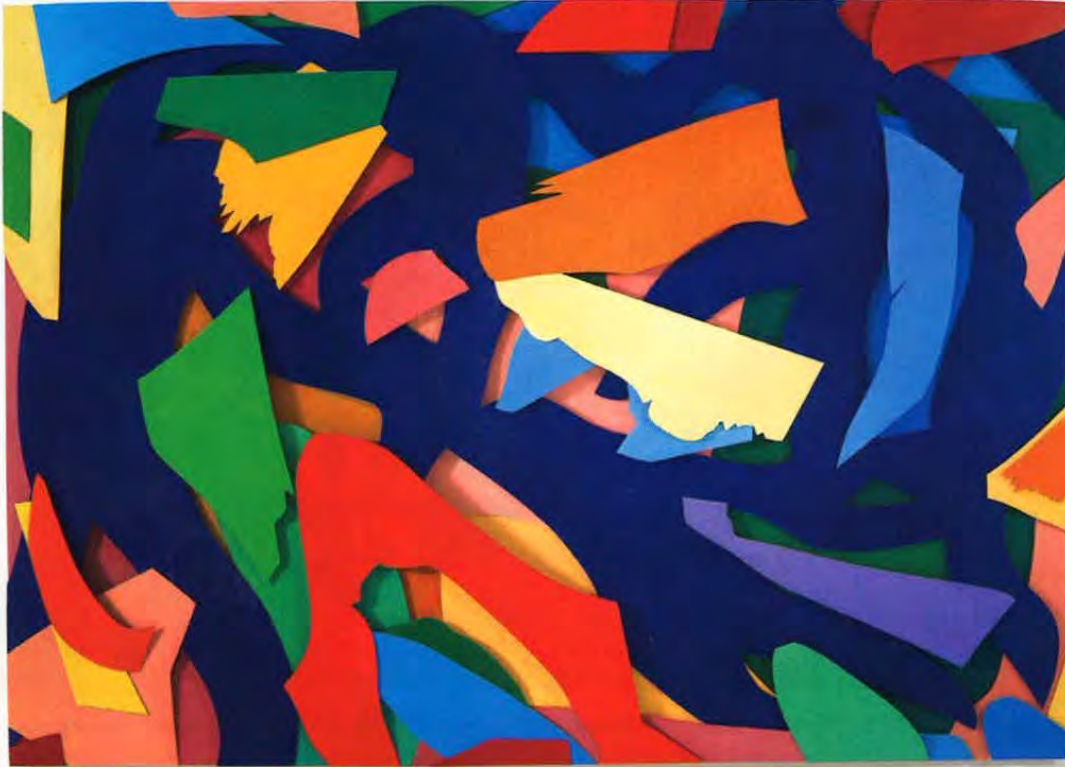
From top: Blue Dance , 1996/2002, oil on cut-out aluminum, 83 x 116 x 5 inches; Landscape #5 , 1964-65, oil on canvas and Liquitex and collage on canvas, 84 x 144 1/2 x 18 inches.

Elegy to the Spanish Republic in the Museum of Modern Art. De Kooning's paintings proved to be an even more powerful experience. However, Wesselmann "felt he had to deny to himself all that he loved in de Kooning, and go in as opposite a direction as possible."