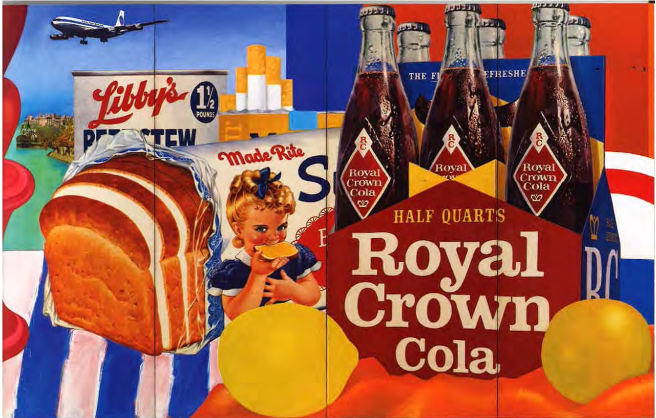
From top: Still Life #35 , 1963, oil and collage on canvas, 120 x 192 inches; Smoker #1 , 1967, oil on shaped canvas, 108 1/2 x 82 1/2 inches

sive, figuratively. I want to stir up intensive, explosive reactions in the viewers.” He certainly accomplished that, and today, even though we experience Wesselmann’s outsized, in-your-face nudes with more distance and equanimity than viewers did 40 or 50 years ago, they still have the power to stir up strong and complex reactions.