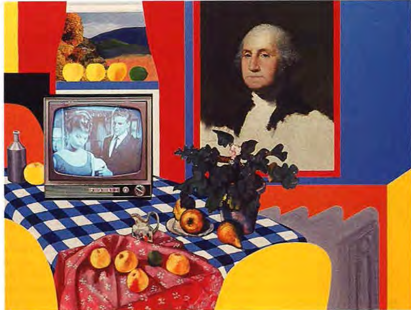
From top: Still Life #31 , 1963, acrylic and collage on board with live tv, 48 x 60 x 11 inches; Sunset Nude with Matisse Odalisque , 2003, oil on canvas, 120 x 100 inches.

In these early works, Wesselmann started breaking out of the flatness of the plane by adding 3-D elements; Still Life #48 is not a conventional painting but an acrylic, collage, and assemblage on board in which the two objects project outward from the frame in relief and rest on a narrow shelf. In Still Life #53 (1964), we again get a piece of fruit adjacent to a mass-produced product, an Art Deco-style Bakelite radio, and the three-dimensionality is conveyed by the fact that the work, although painted, is made of