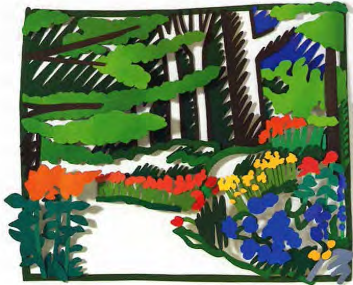
From top: Alice's Front Yard (3-D) , 1993, oil on cut-out aluminum, 70 x 86 x 5 inches; Great American Nude #1 , 1961, mixed media and collage on board, 48 x 48 inches.

Finally, in the few years before his death, Wesselmann returned to the female form with his “Sunset Nudes.” In these works, the struggle between negative and positive space is resolved in a way that restores satisfaction to the eye. The contours of the negative space now go inside the body, so that each nude, tan and glowing with health, appears to have a ghostly second body inside her. The tropical backgrounds evoke the Mediterranean world of Matisse; in fact, in one of them, Sunset Nude with Matisse Odalisque (2003), the French master's borrowed figure sits behind the modern woman, as a kind of presiding spirit. In these magisterial works, Wesselmann combined the modernist project of subverting expectations with American exuberance and a Matissean sense of joy in color and sensual pleasure. With Wesselmann's works in general, we get an education in perception, but painlessly, as if sugar-coated with sheer delight. A