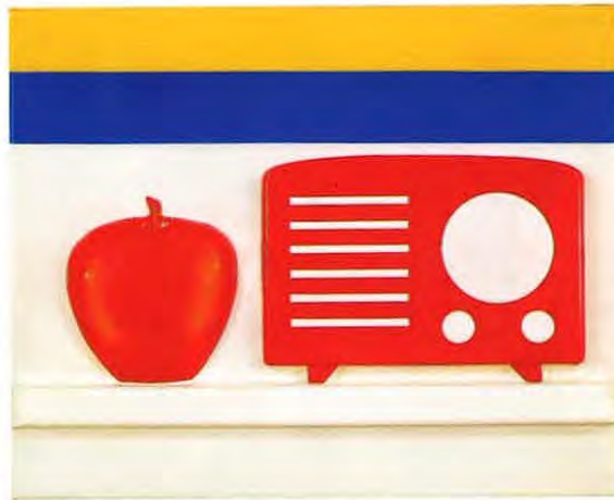
Clockwise from top left: Still Life #48 , 1964, acrylic, collage and assemblage on board, 48 x 60 x 8 inches; Still Life #53 , 1964, painted molded plastic (Grip-flex on uvex), 47 1/2 x 58 x 5 inches, edition of 4; Bedroom Painting #68 , 1983, oil on shaped canvas, 89 x 112 1/2 inches; Interior #2 , 1964, acrylic, collage, assemblage including working fan, clock and fluorescent light, 60 x 48 x 5 inches.

molded plastic. In Interior #2 , also from 1964, Wesselmann went much further, attaching a real window fan, clock, and fluorescent light to the picture plane, in order to make the viewer feel like he or she is truly inside a kitchen. But the verisimilitude is immediately subverted by the grisaille palette, in which the 7-Up bottle is drained of its characteristic green and red colors. In works such as these, Wesselmann is playing with perception in ways that go well beyond the Pop program.