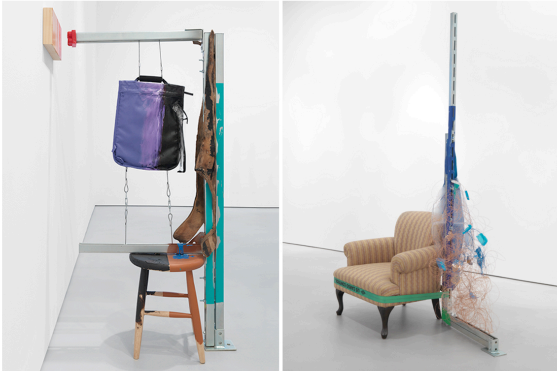
The multimedia sculptures Security Detail (left) and Assist: Smoke and Mirrors, both from 2016, are included in Jessica Stockholder's solo show at Mitchell Innes and Nash.

In Jessica Stockholder's first show at Mitchell Innes and Nash since 2012, the pioneering mixed-media artist presents a new series of her curious hybrids. She makes her pieces by combining found and purchased objects, then altering and embellishing them with her own artistic materials, adding paint, string and the like. Included in the show is a large-scale site-specific stage-like structure as well as several of her "Assists," sculptures that must lean on something to stand upright; here, two of them rest against matching club chairs . There is also a work incorporating a little stool, and another employing an ice-cube tray. Stockholder's use of building materials, hardware-store finds and furnishings provides a disconcertingly domestic subtext. She binds these elements neatly into household vignettes that feel familiar but still seem oddly wrong, as though they'd been created by some destructive force.