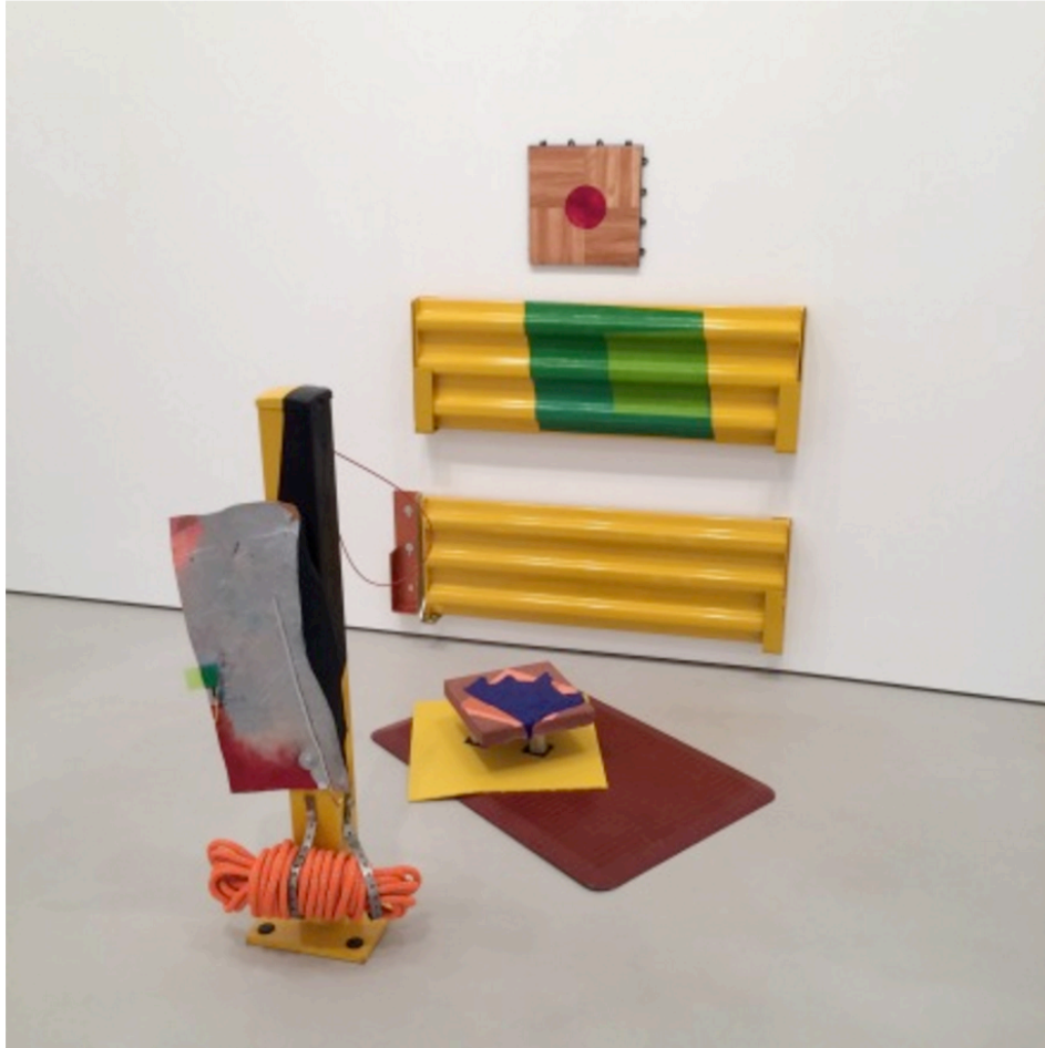
Jessica Stockholder, Detached Detail [JS 685] (2016)

Despite the way in which The Guests All Crowded Into the Dining Room transforms the perception of a space, Stockholder is hesitant to call her work installation art. In the past, she has instead described her work as creating a “situation,” which resonates strongly with the viewer’s experience of the exhibition. The structural intersections created in Stockholder’s exhibition create a community of artwork, in which boundaries become so fluid so as to cease to exist.