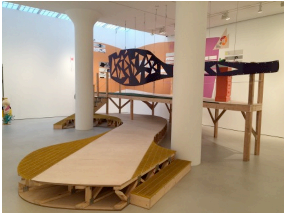
Jessica Stockholder, The Guests All Crowded Into the Dining Room (Installation View)

In The Guests All Crowded Into the Dining Room , Jessica Stockholder's scattered arrangements of sculptural elements play with assumed boundaries to become a fluid meditation on space. Through a variety of materials and forms, Stockholder avoids overtly breaking down traditional artistic lines, so much as she highlights that they have never truly existed at all. Here, in her third show at Mitchell-Innes & Nash , Stockholder adds new dimension to her longstanding interest in intersection and continues to define the multifaceted significance of surface and structure.