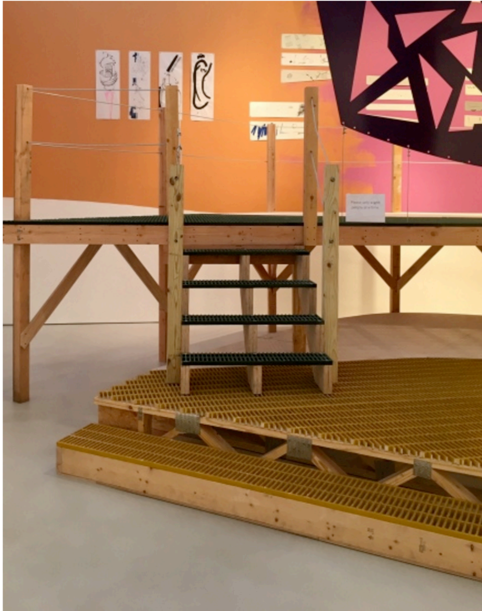
Jessica Stockholder, The Guests All Crowded Into the Dining Room (Installation View), via Art Observed

Through this interest in the interplay between various types of art forms, Stockholder plays with the conventions and preconditions of the art object. In many ways, her interest in the significance of structure speaks to the Deconstructionist impulse to break down traditional surfaces in order to create something new. Similarly, many of her materials—seashells, vibrant plastics—play with constructions of kitsch through Stockholder’s use of found, bought, or gifted materials.