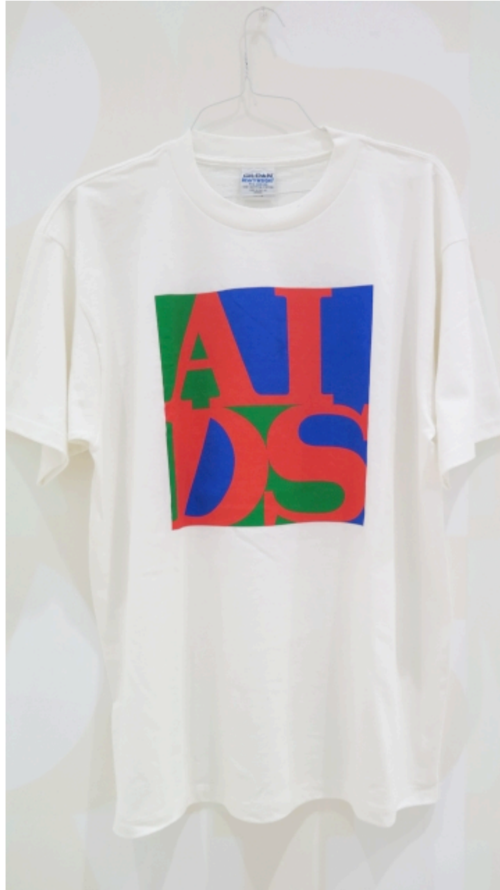
General Idea, "AIDS" T-shirt

It's a rare pleasure to see an artist or group of artists make their strongest work near the end (Cy Twombly's 2014 retrospective, Paradise , provided an astonishing example). For General Idea — which consisted of AA Bronson (born 1946), Felix Partz (1945–94), and Jorge Zontal (1944–94) — the impending misery of death brought about action rather than despair. The group approached the most serious possible subject matter