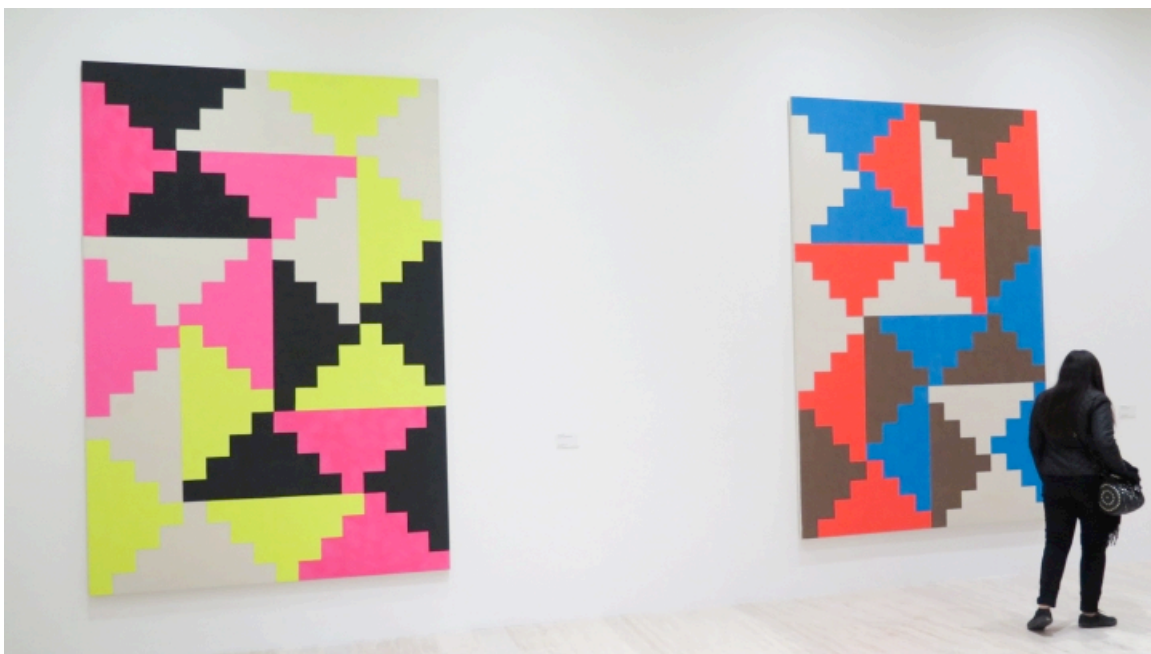
General Idea, "Mimi" (1968--69)

Devon Van Houten Maldonado | December 20, 2016