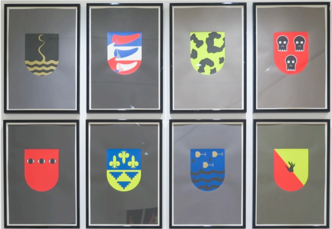
General Idea, "Fear Management" (1987)