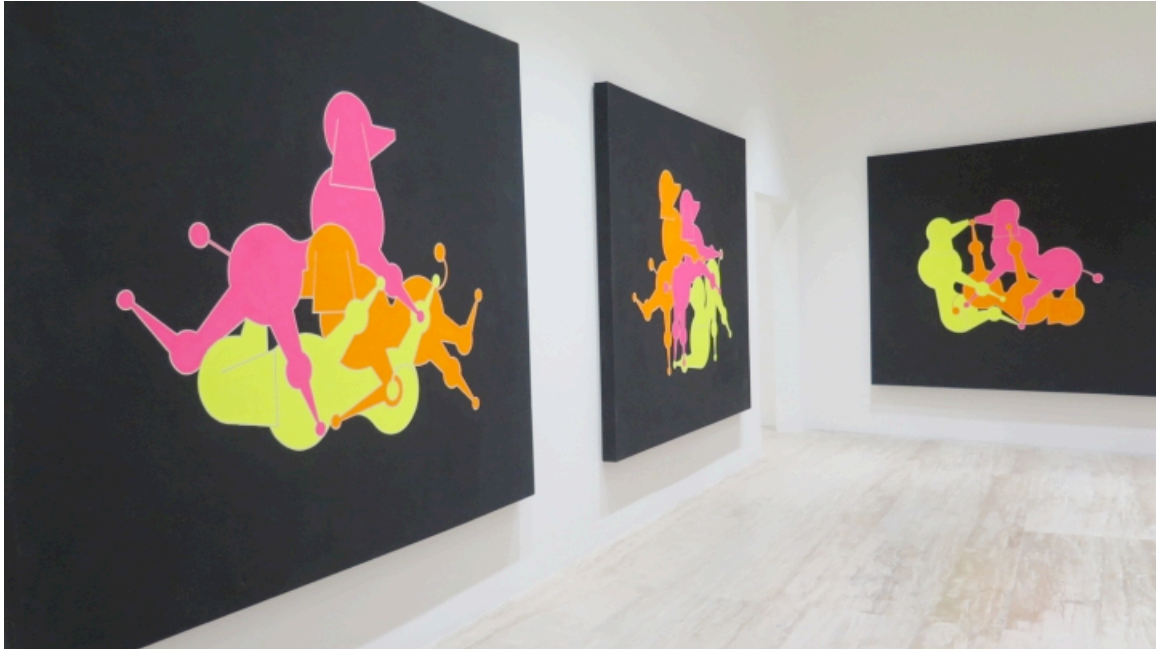
General Idea, “Modo Cane Kama Sutra” (1984), set of 10 paintings

It’s encouraging that the Jumex team has gained back some specificity and moved — at least a little bit — away from over hanging its galleries and cluttering the exhibition spaces. The exhibition is still packed to the gills, but for the most part not gratuitously so. That said, one large gallery of Broken Time is completely taken up by an irritating installation that seems intended to protest climate change. Titled “Fin de siècle” (1990), it consists of a group of toy stuffed seals sitting on a sea of Styrofoam in place of ice — in other words, a crazy waste of space. It would have been a more effective use of space if the giant foam monstrosity was left out and the rest of the work was given some room to breath. As such, it makes for a truly bewildering, off-topic departure from a catalogue of poignant and ephemeral projects activated by tangible action.