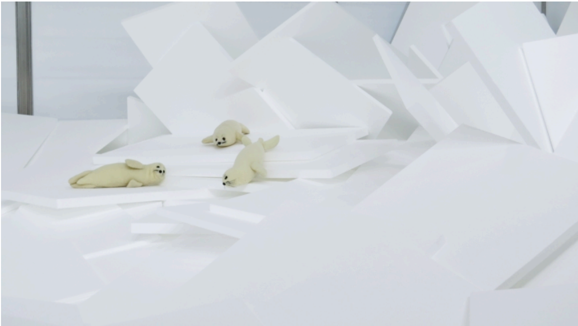
General Idea, "Fin de siècle" (1990)