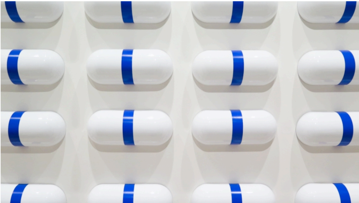
Installation view of General Idea's Broken Time at the Jumex Museum

This retrospective, titled Broken Time , is framed by a repeating bas relief motif of giant pills — a visualization of the countless drugs those infected with HIV ingested in hopes of lessening the deadly effects of the illness — and the collective's most iconic image, a repeated pattern of the “AIDS” acronym modeled after Robert Indiana's famous “ LOVE ” prints and sculptures. The evolution that the work takes, chronologically laid out across two floors of the museum, is drastic, beginning with text, video, and performance work derivative of the Fluxus and Dada groups, and ending with tweaked commercial objects pleading the urgency of the AIDS crisis, including a General Idea brand “Jockey Short Shopping Bag” and a series of caricature self-portraits by the three artists.