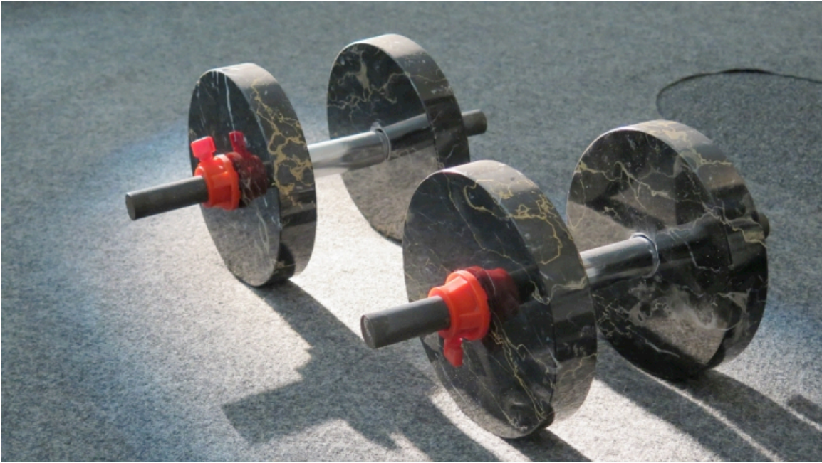
General Idea, “Reconstructing Futures” (1977), detail

Unsurprisingly, some of General Idea’s more absurd and improvisational musings on the nature of performance and art practice were met with eviscerating criticisms or outright incomprehension. “I think it’s a practical joke and a waste of money, and somebody is putting us on,” a representative of the St. Lawrence Centre for the Arts told General Idea in a phone conversation that the artists documented during a presentation of their 1970 performance “What Happened” at the Festival of Underground Theater in Toronto. The multi-part performance, which was based on Gertrude Stein’s play of the same name , was spread across the three week festival and included the “Miss General Idea Pageant.”