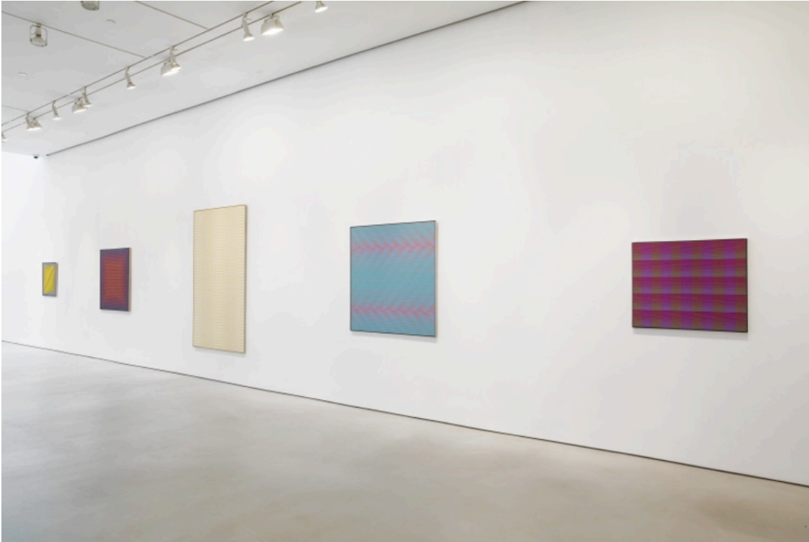
Julian Stanczak - The Life of the Surface, Paintings 1970 – 1975, installation view at Mitchell-Innes and Nash NY, 2017