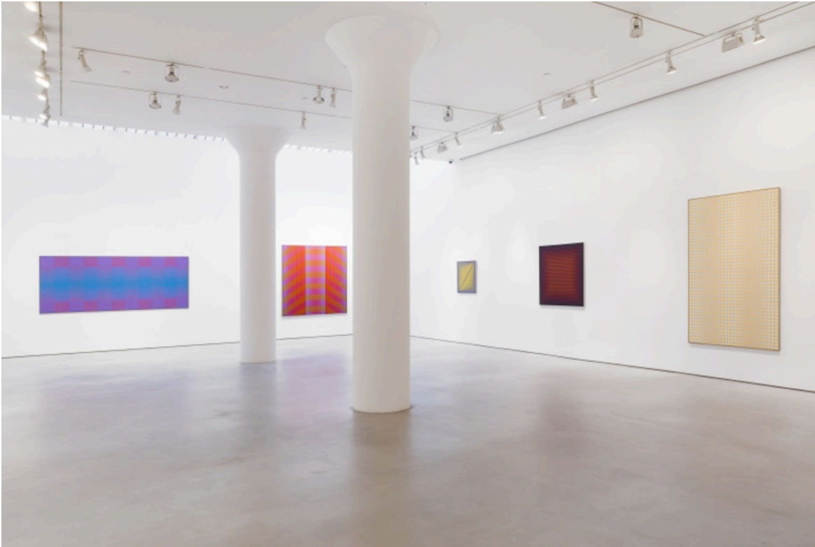
Julian Stanczak - The Life of the Surface, Paintings 1970 – 1975, installation view at Mitchell-Innes and Nash NY, 2017